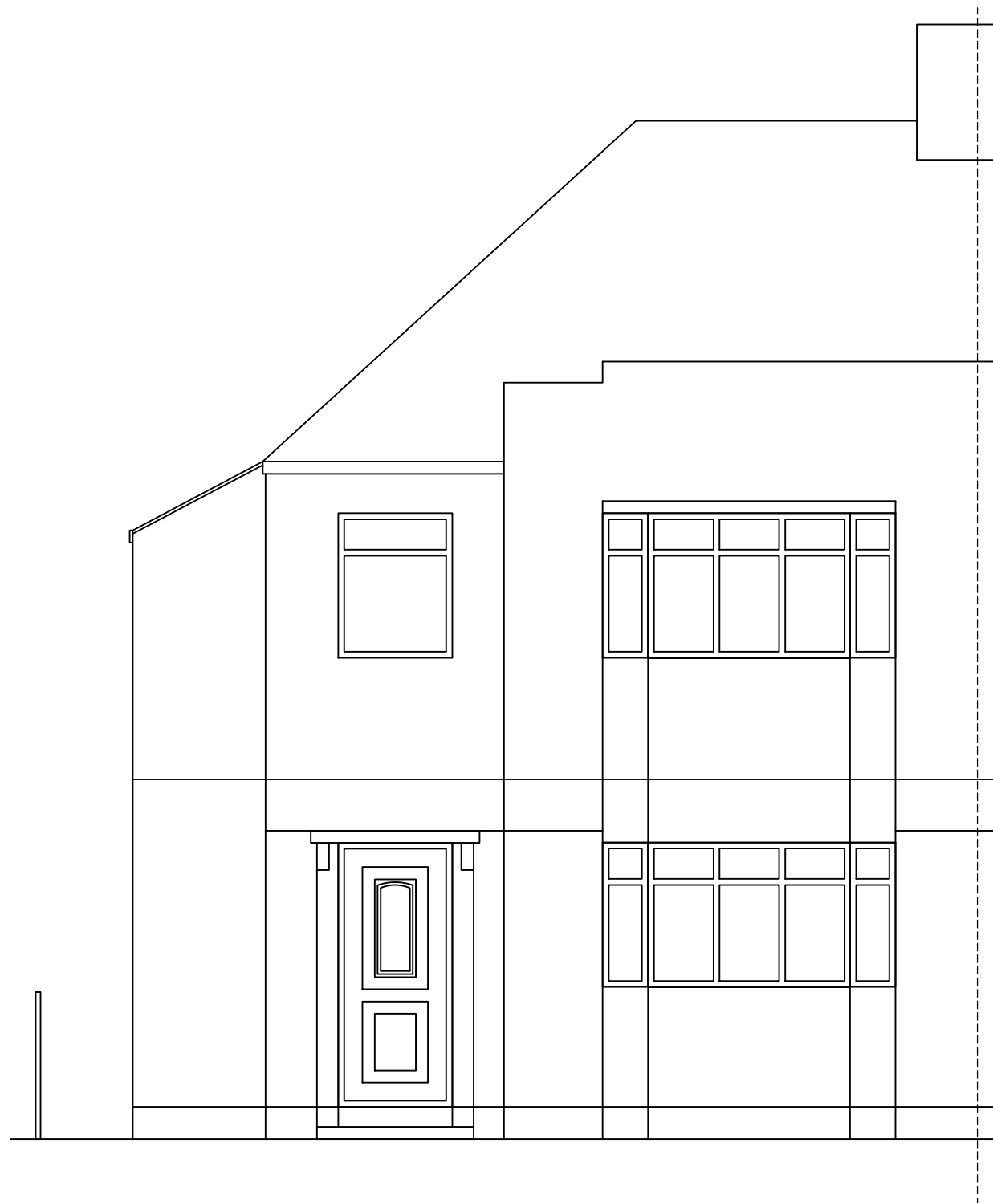
Existing East Elevation Scale 1:50