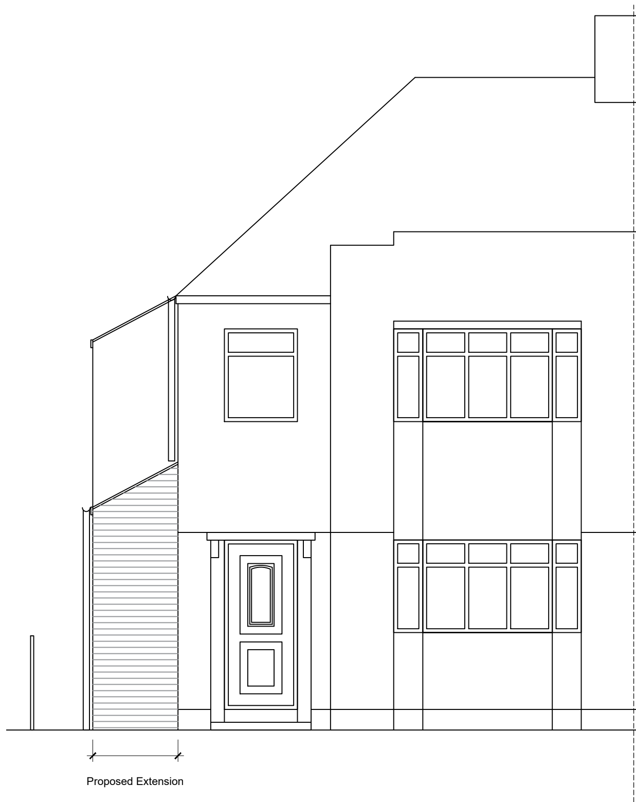
Proposed East Elevation Scale 1:50