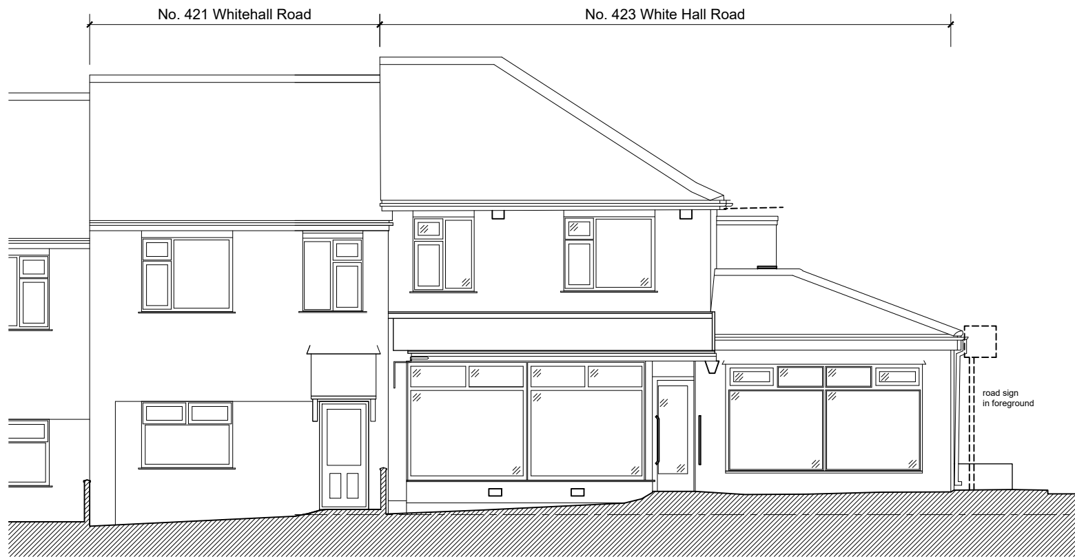
WHITEHALL ROAD ELEVATION