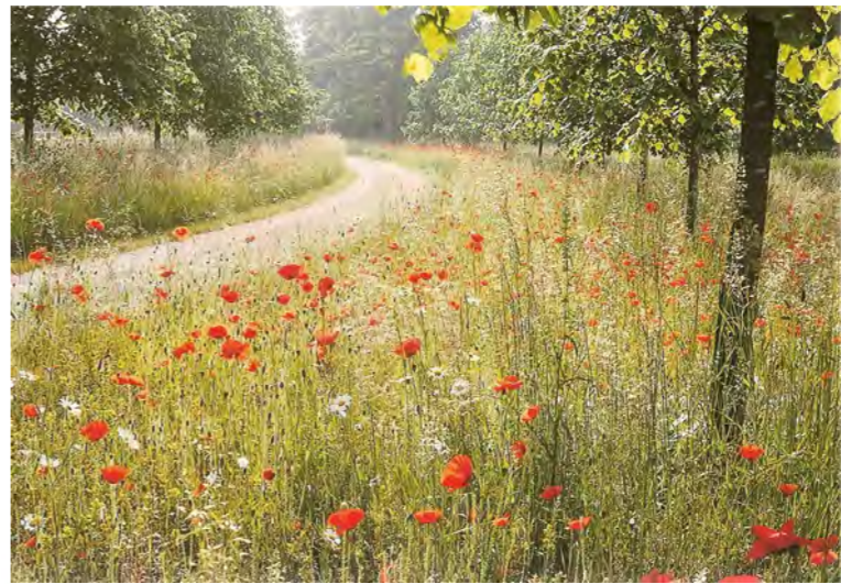
Rhododendrons cleared from drive to open up views into this area