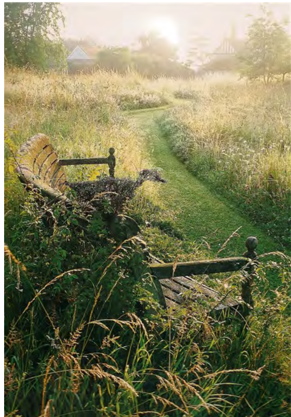
Mown paths cut through the area, between existing and new trees