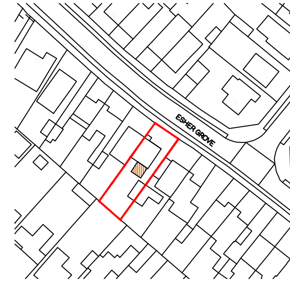
SITE LOCATION SCALE 1:1250

Proposed single storey rear extension after demolition of sun lounge at: 35 Esher Grove Waterlooville PO7 6XG