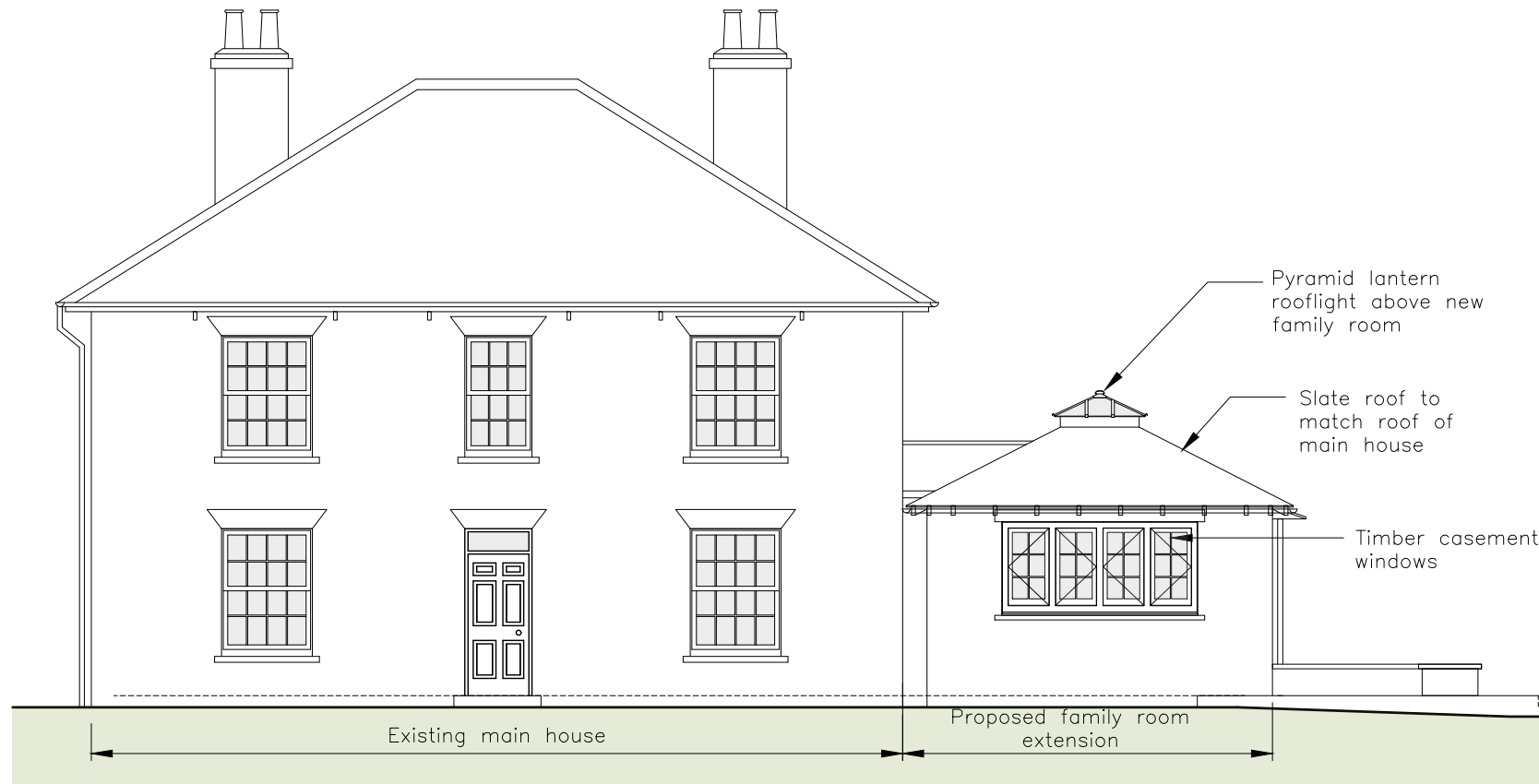
WEST ELEVATION – AS PROPOSED SCALE 1:100