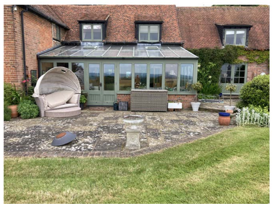
EXISTING REAR VIEW