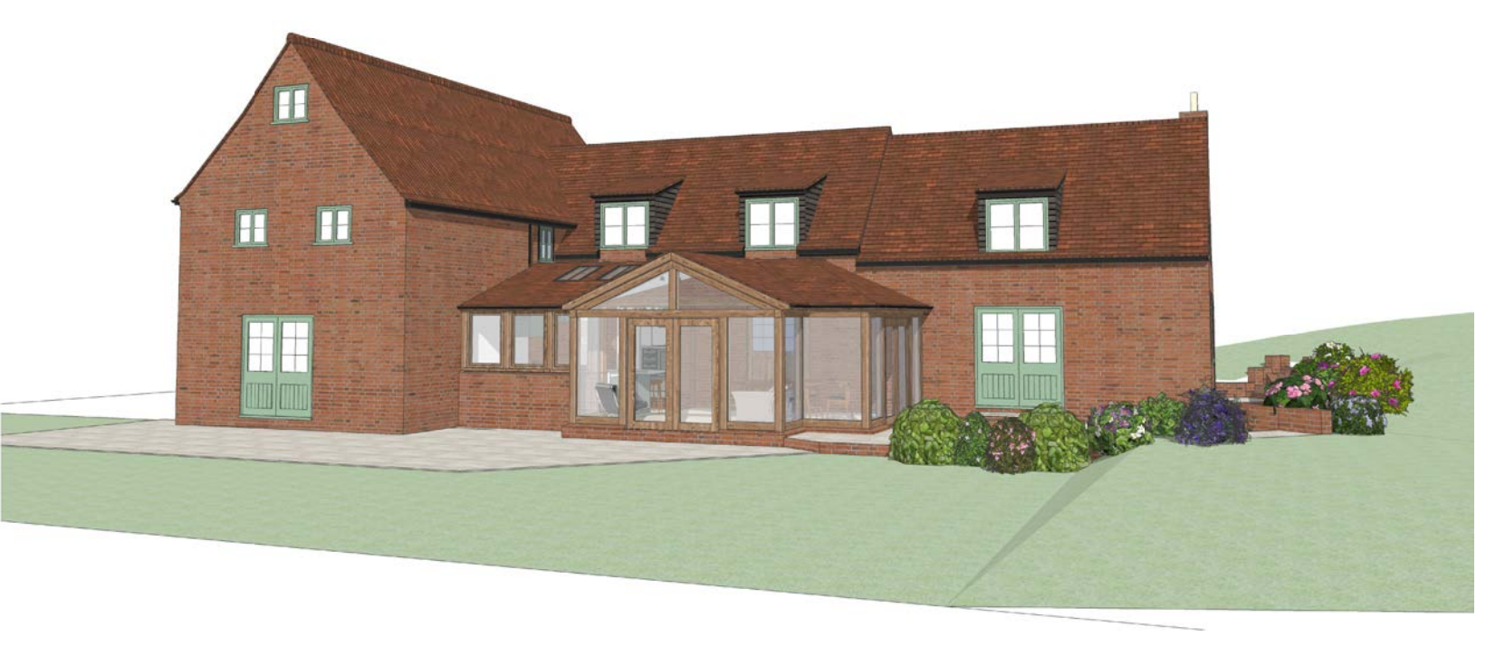
PROPOSED REAR 3D VIEW