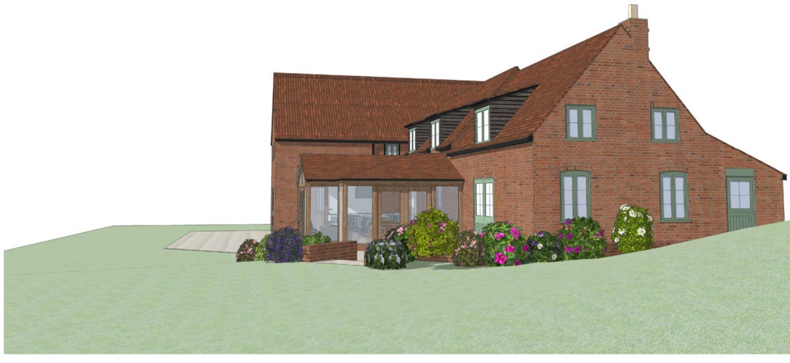
PROPOSED SIDE 3D VIEW