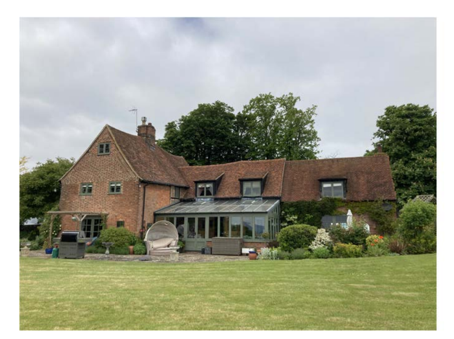
EXISTING REAR VIEW