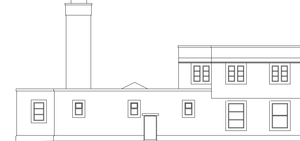
Existing North Elevation (Side) 1:200