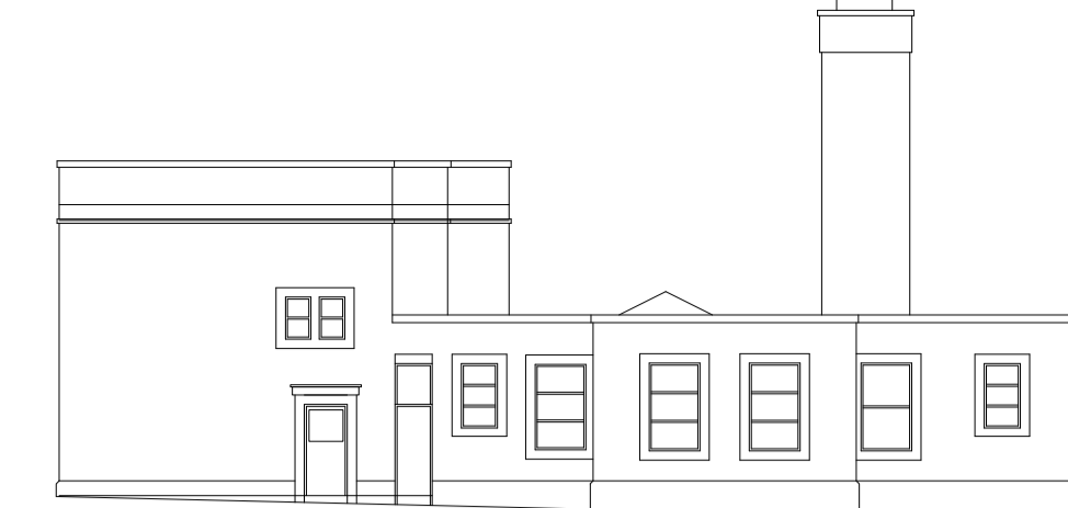
Existing South Elevation (Side) 1:200