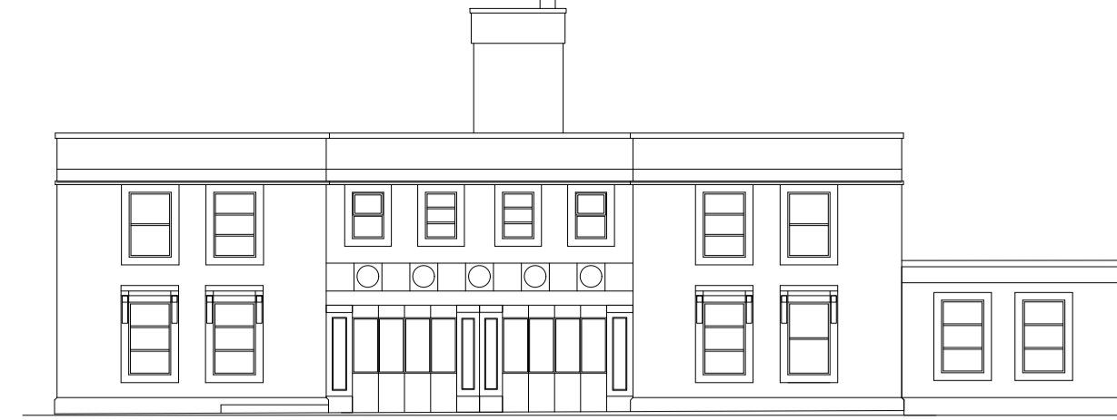
Existing West Elevation (Front) 1:200