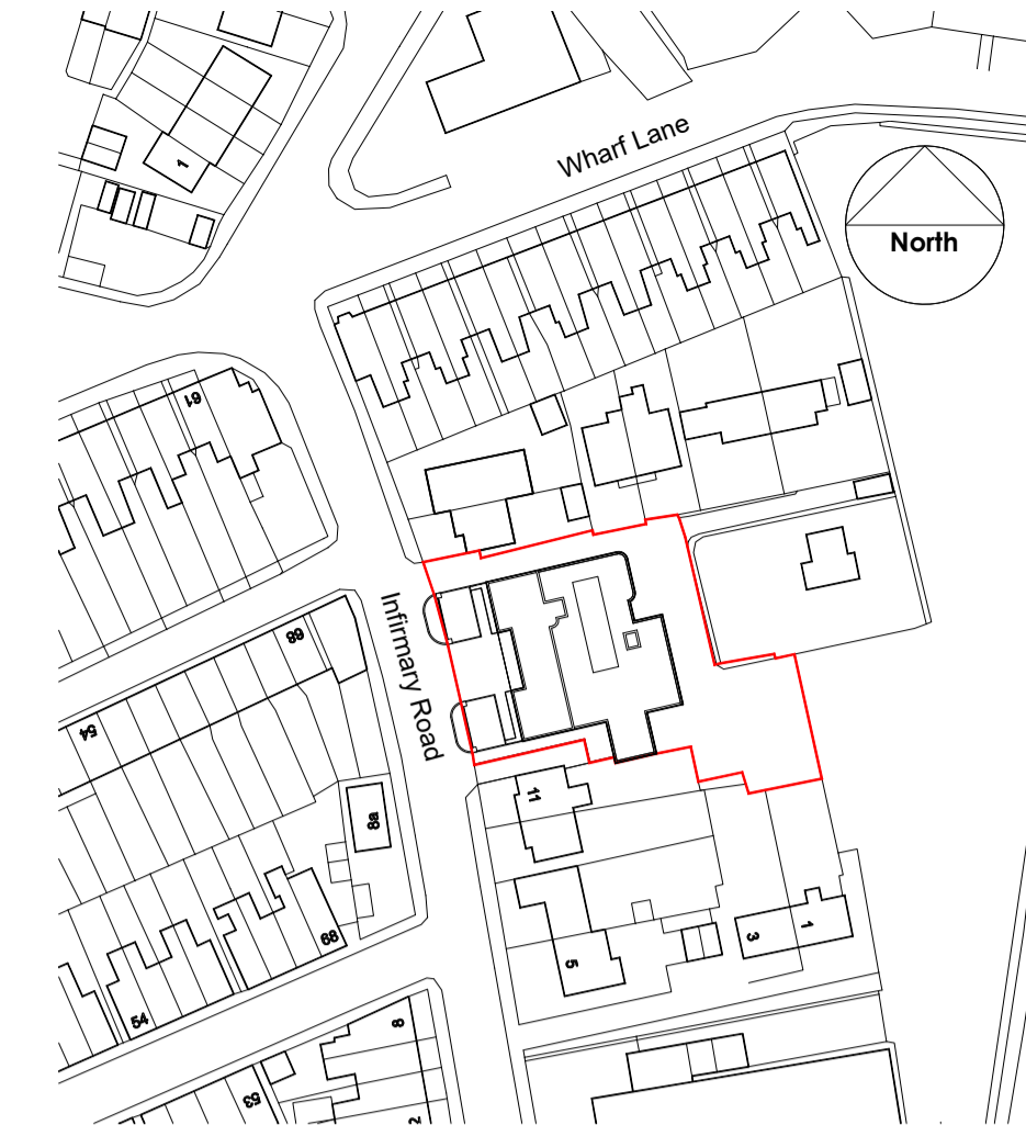
Site Location Plan (1:1250)