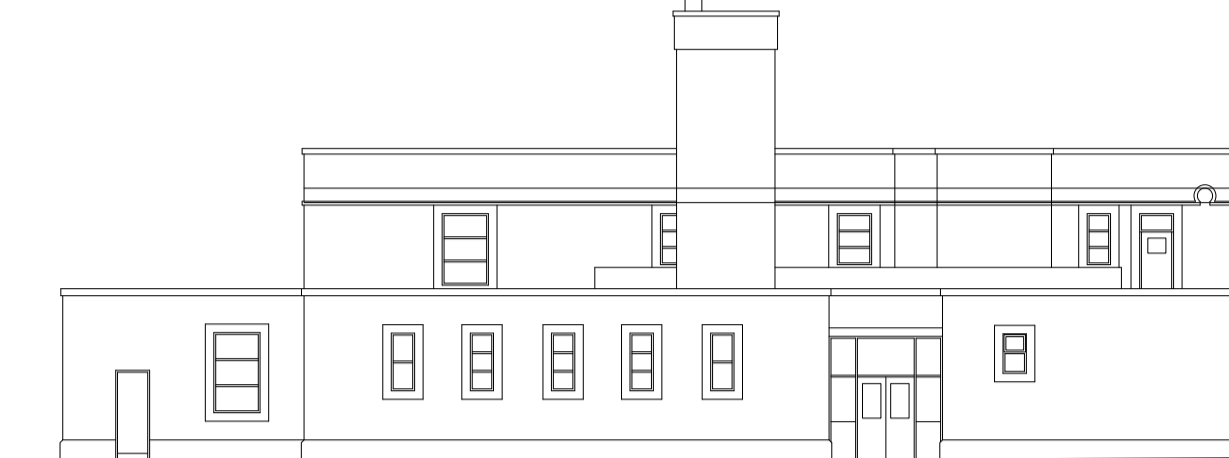
Existing East Elevation (Rear) 1:200