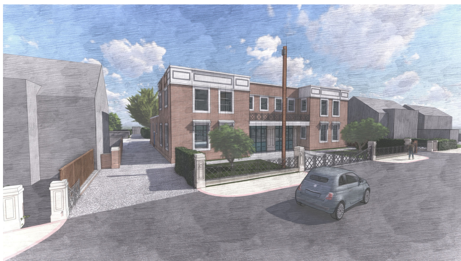
Existing Site Visuals NTS