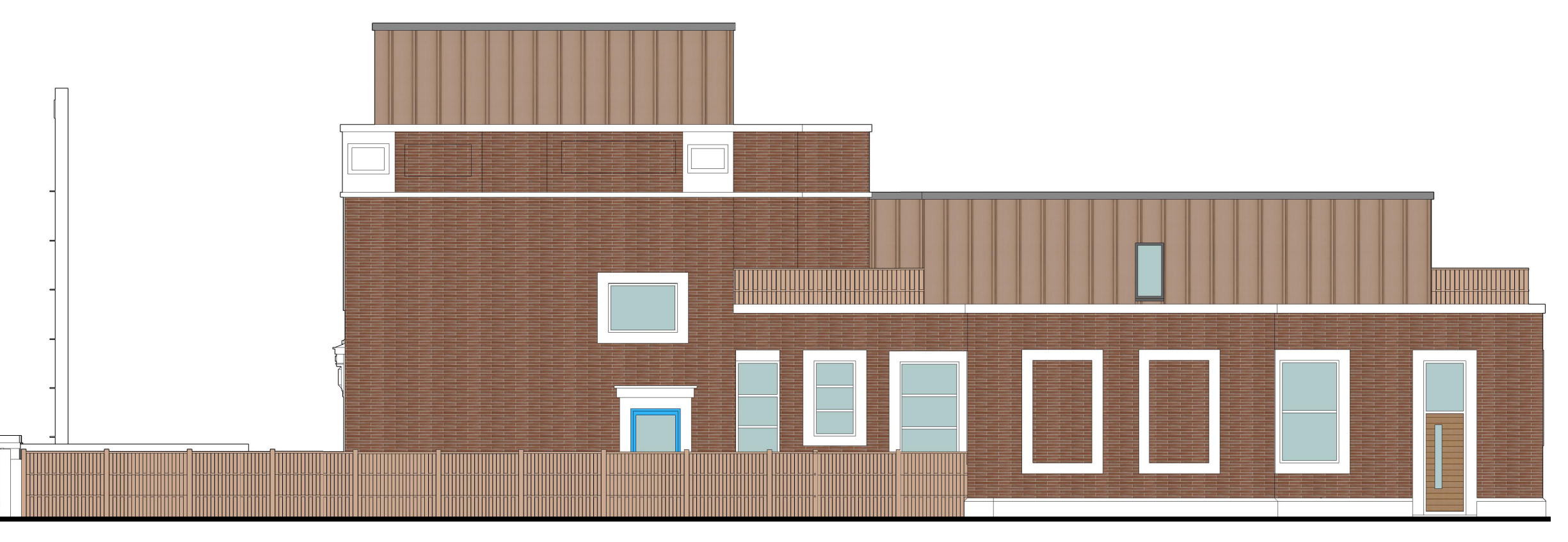
Proposed South Elevation (Side) 1:100