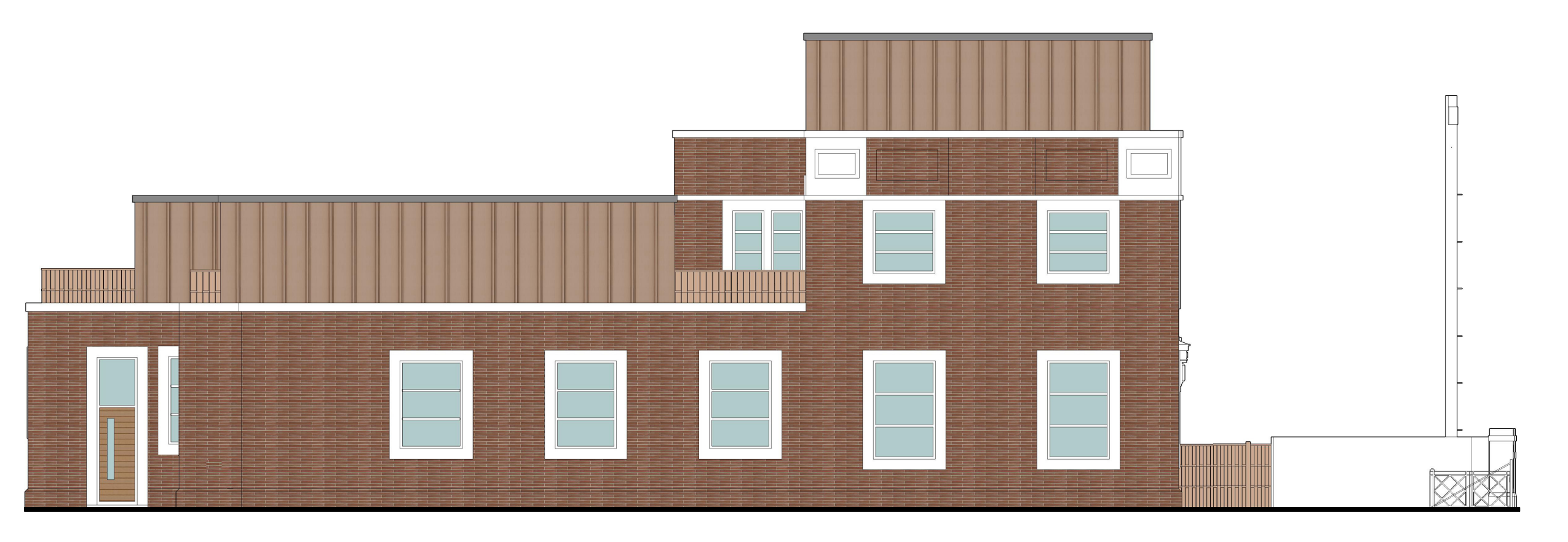
Proposed North Elevation (Side) 1:100