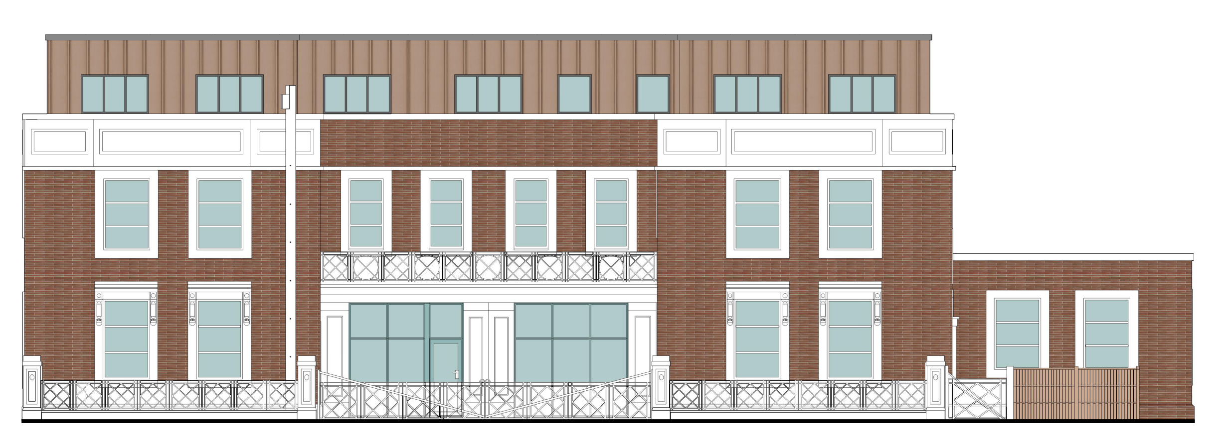
Proposed West Elevation (Front) 1:100