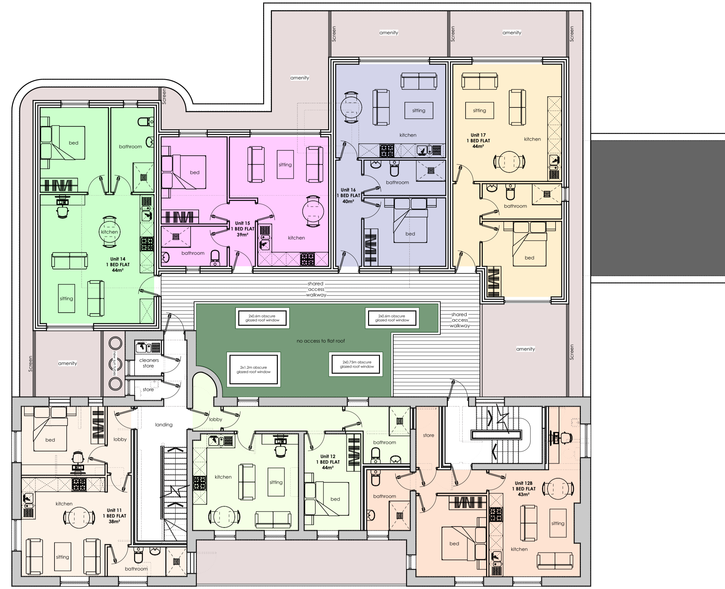
Proposed First Floor Plan 1:100