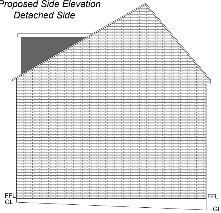
Proposed Side Elevation Detached Side