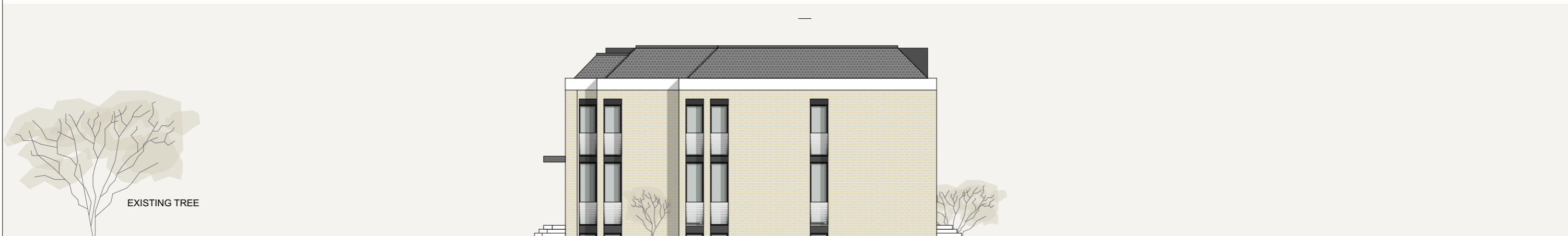
NORTH SIDE ELEVATION PROPOSED