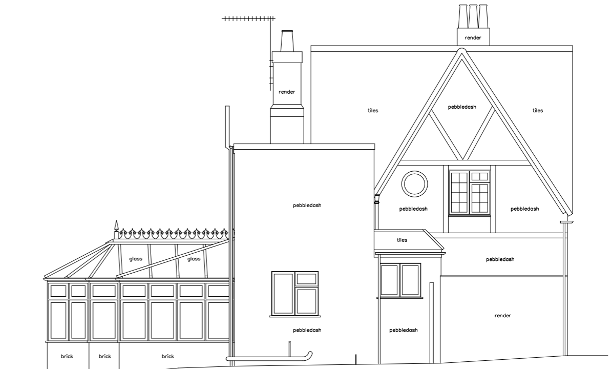
SOUTH SIDE ELEVATION EXISTING