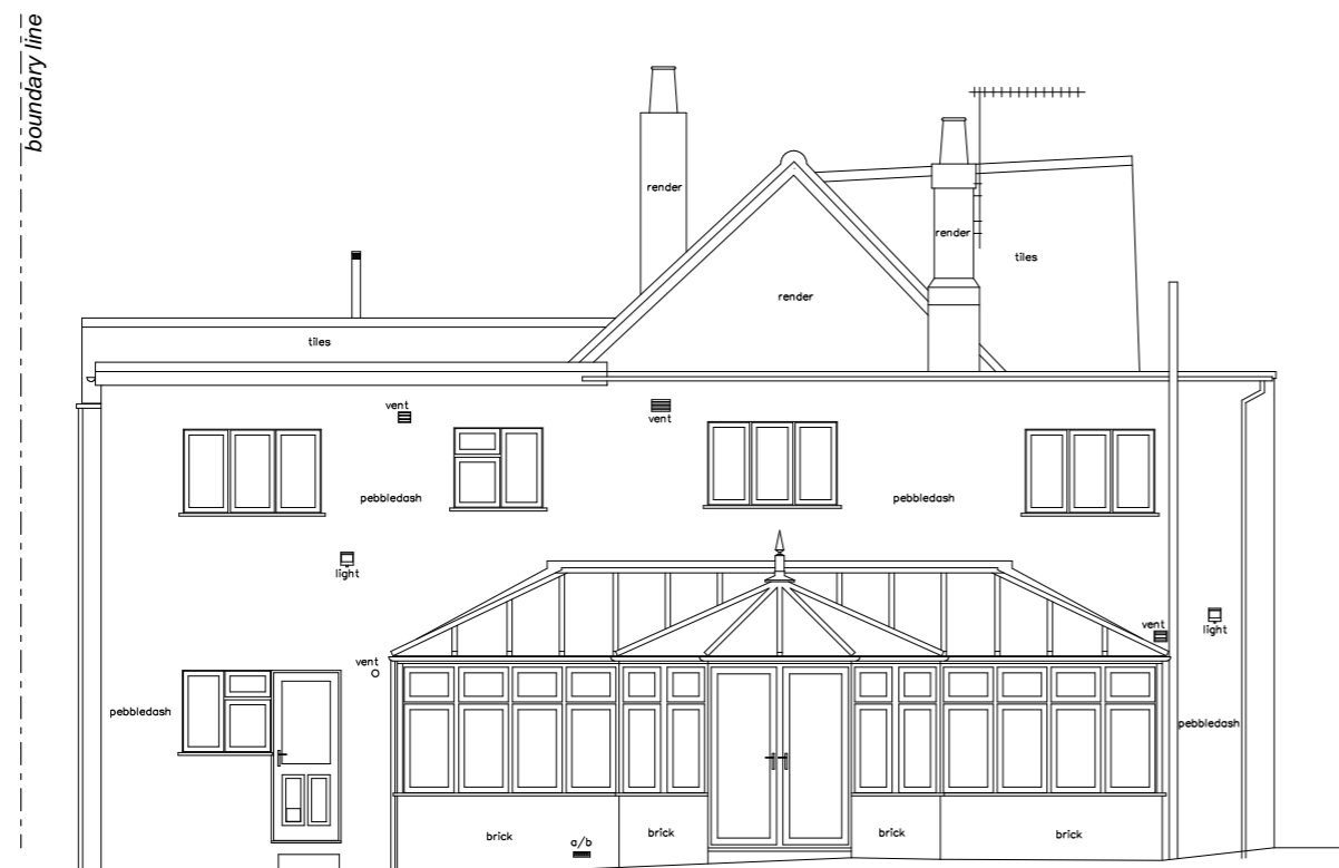
REAR ELEVATION EXISTING