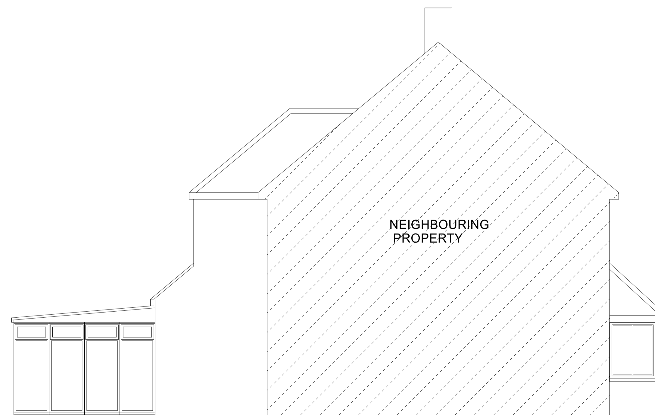
SIDE (NORTH) ELEVATION