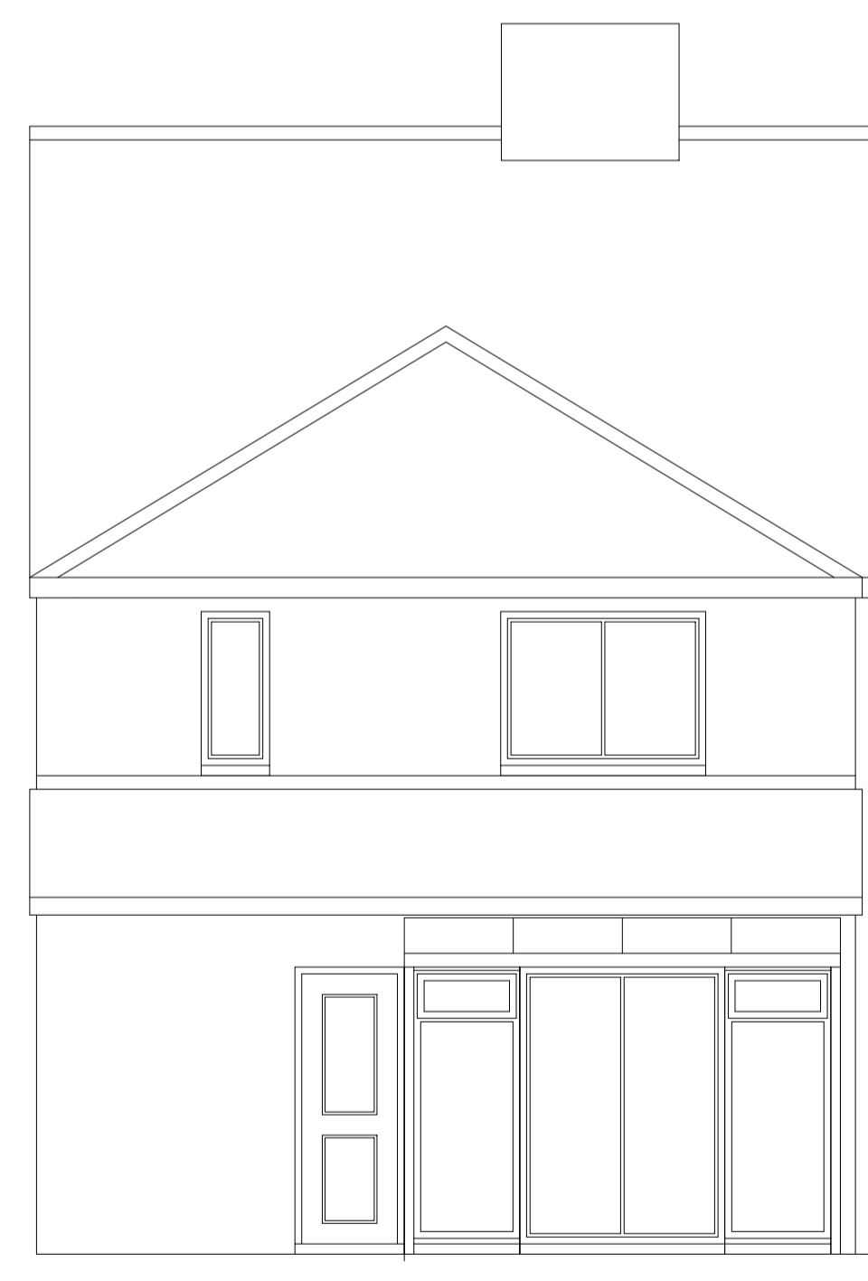
REAR (EAST) ELEVATION