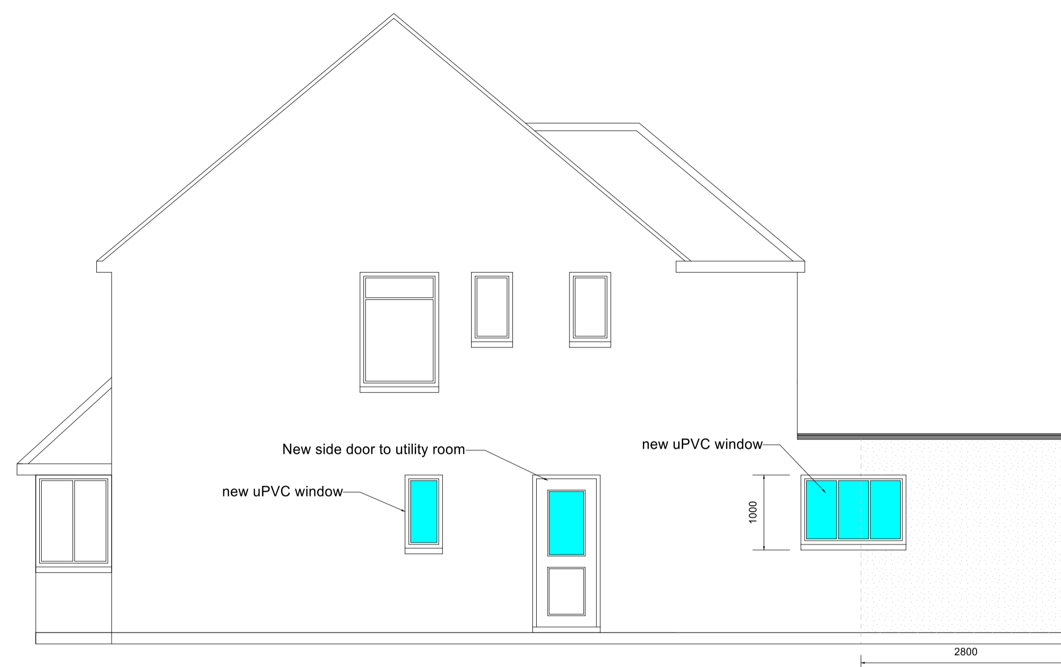
SIDE (SOUTH) ELEVATION