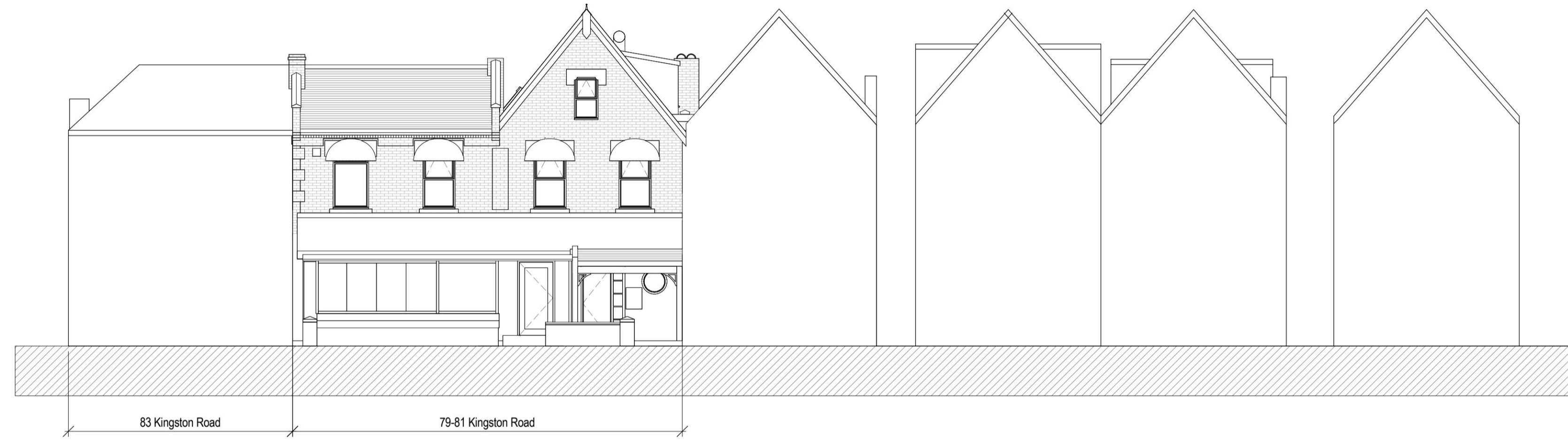
1 Existing Street Elevation 1 : 100