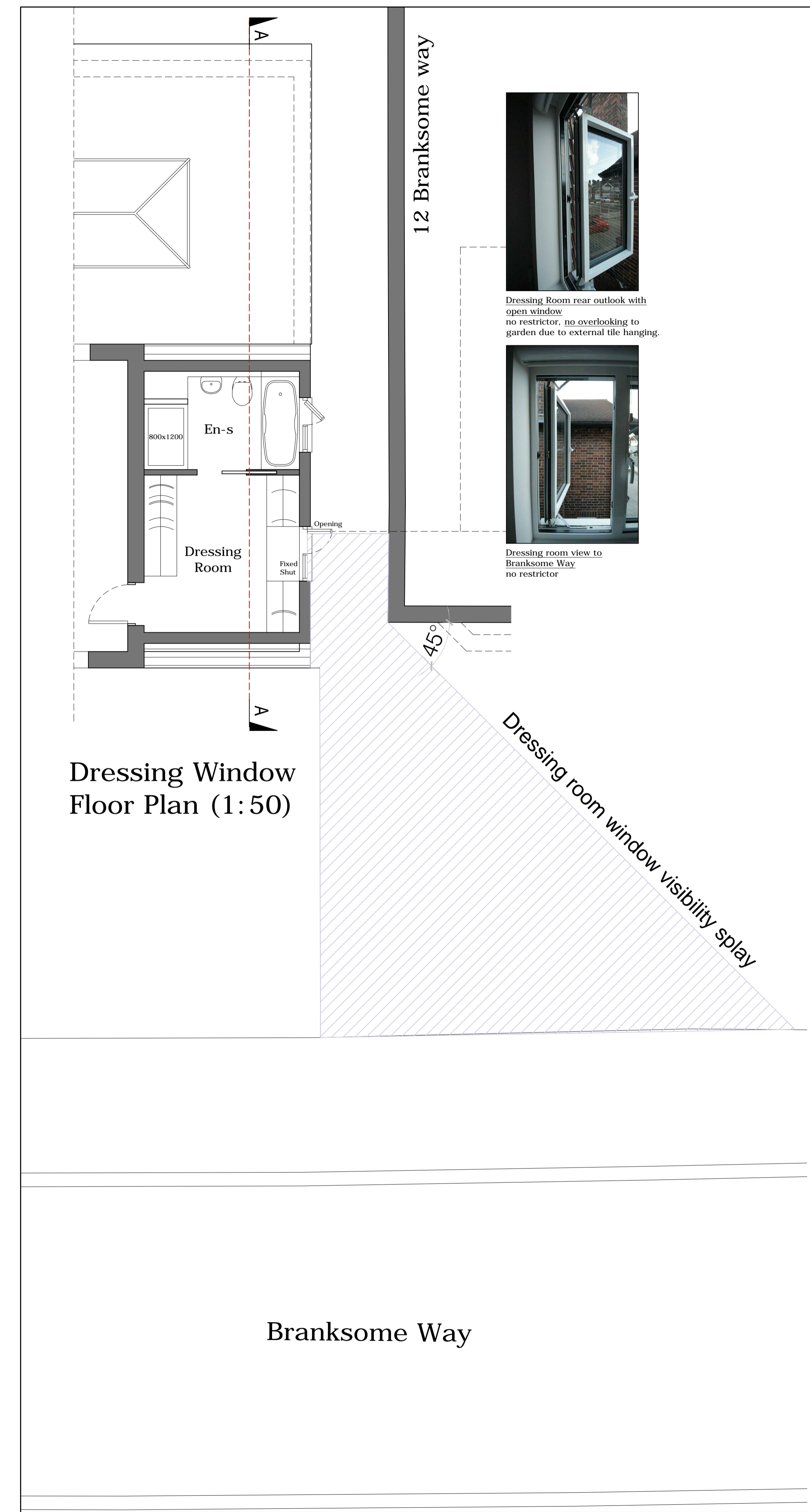
Dressing Window Floor Plan (1:50)

Aspects Architectural Services Ltd. St Stephens House, Arthur Road, Windsor, SL4 1RU www.aspects-as.co.uk