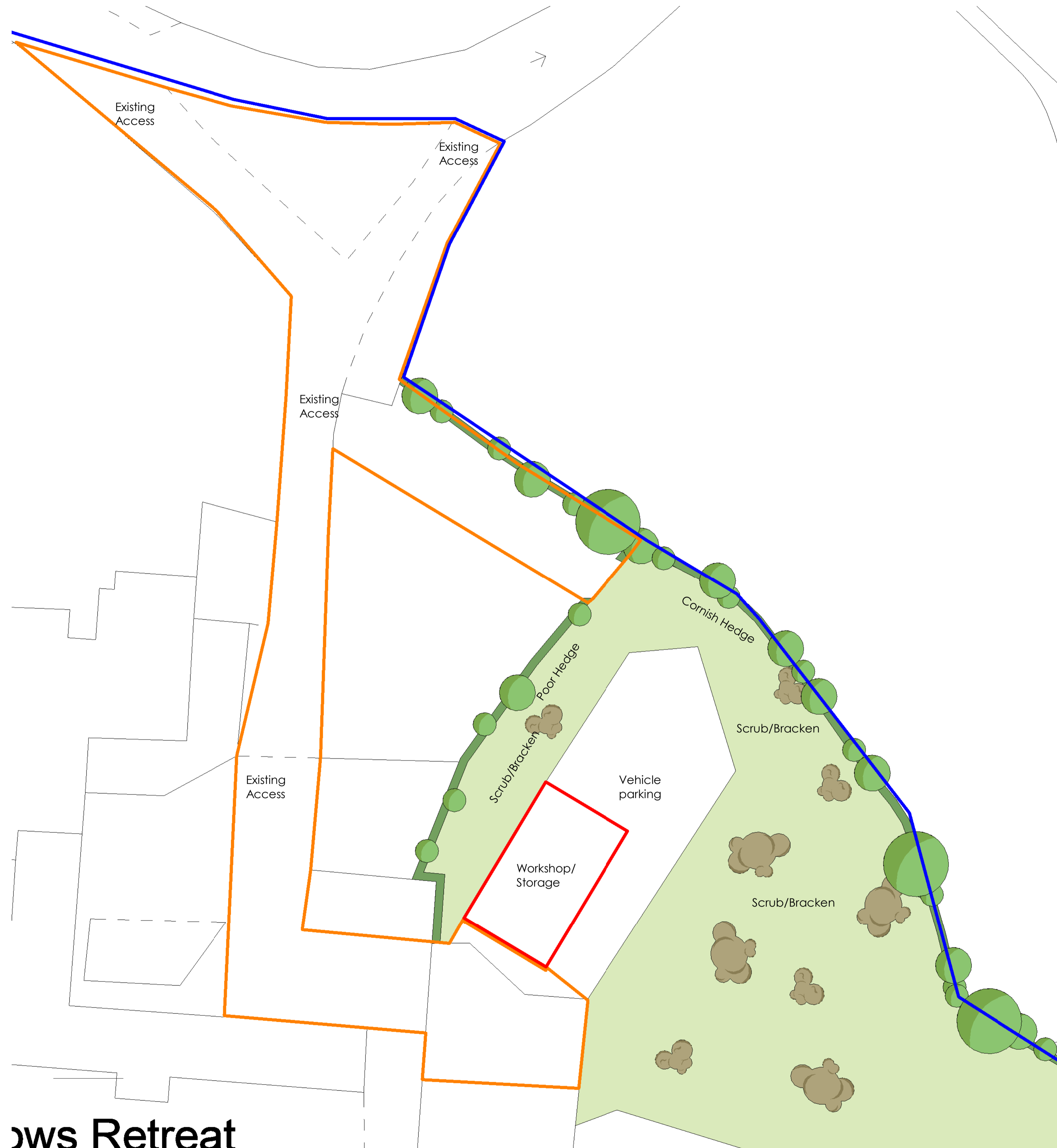
Existing Site Plan 1 : 200