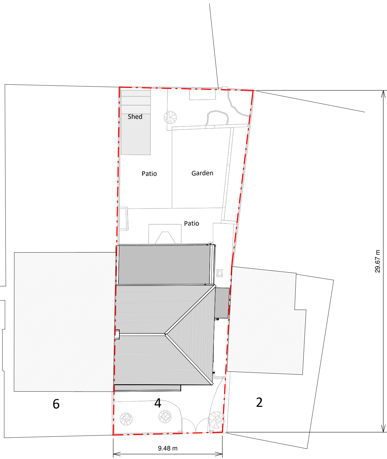
Existing Block Plan