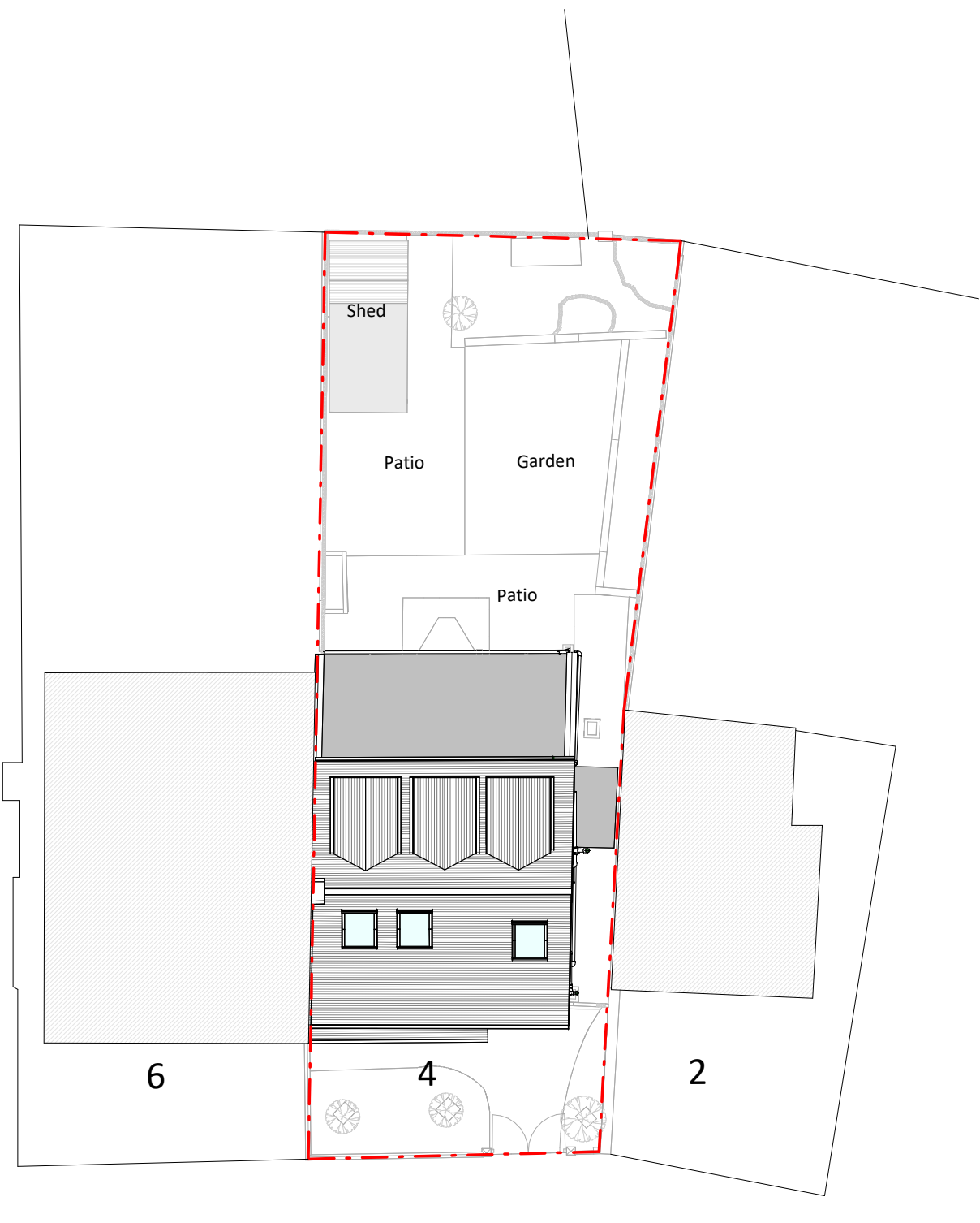
Proposed Block Plan