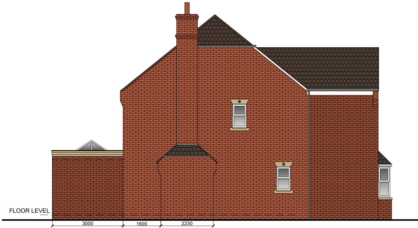
PROPOSED SIDE (NORTH) ELEVATION

0 1 2 3 4 5m ALL DIMENSIONS IN CENTIMETERS