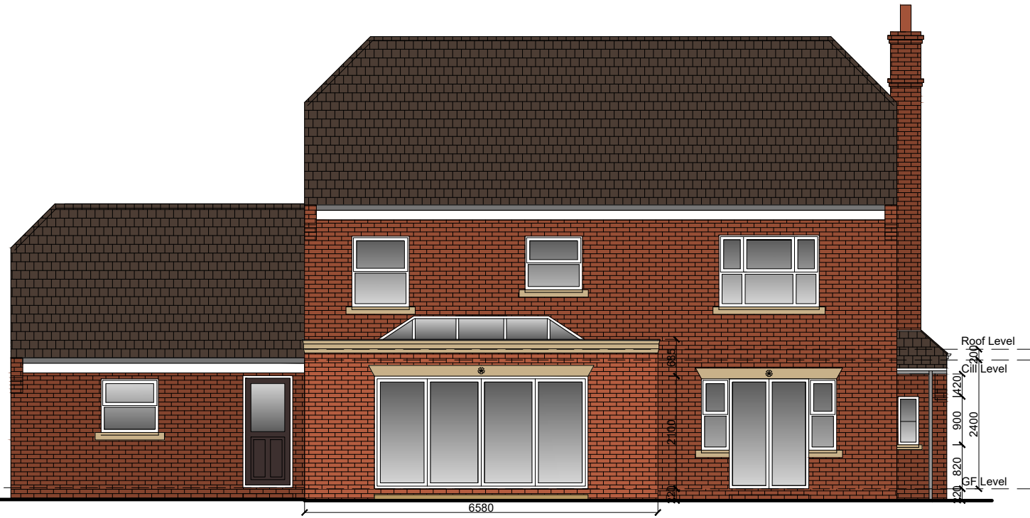
PROPOSED REAR (EAST) ELEVATION