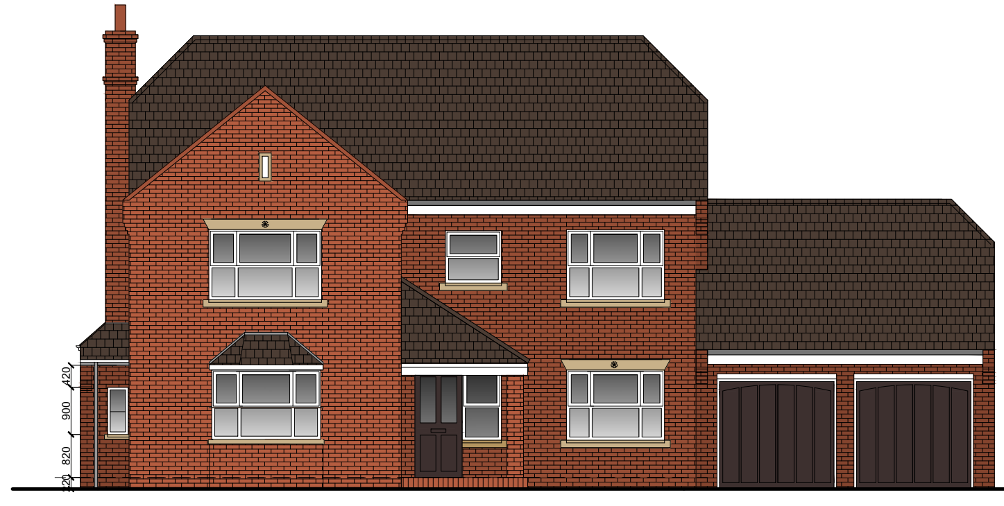
PROPOSED FRONT (WEST) ELEVATION