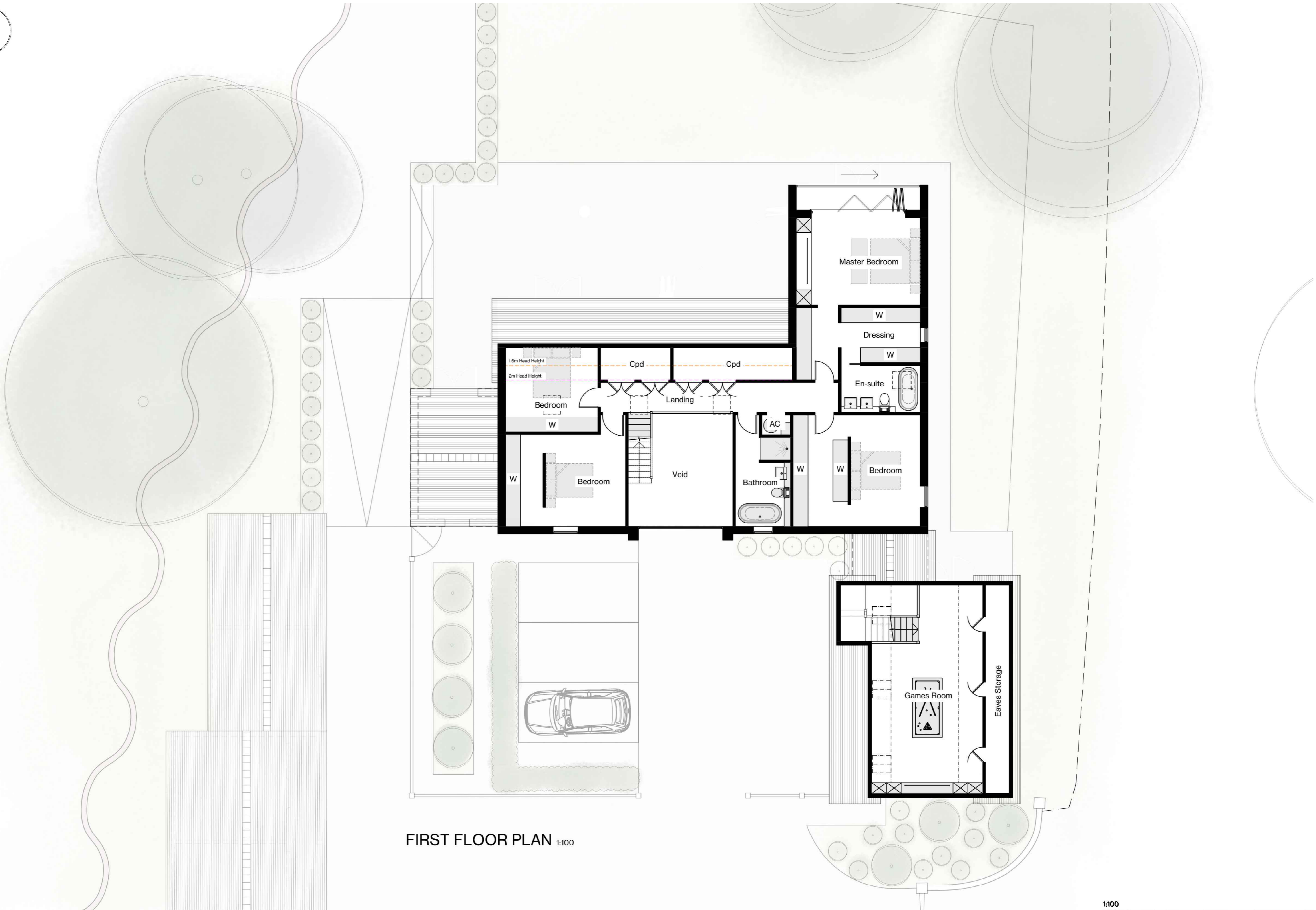
FIRST FLOOR PLAN 1:100