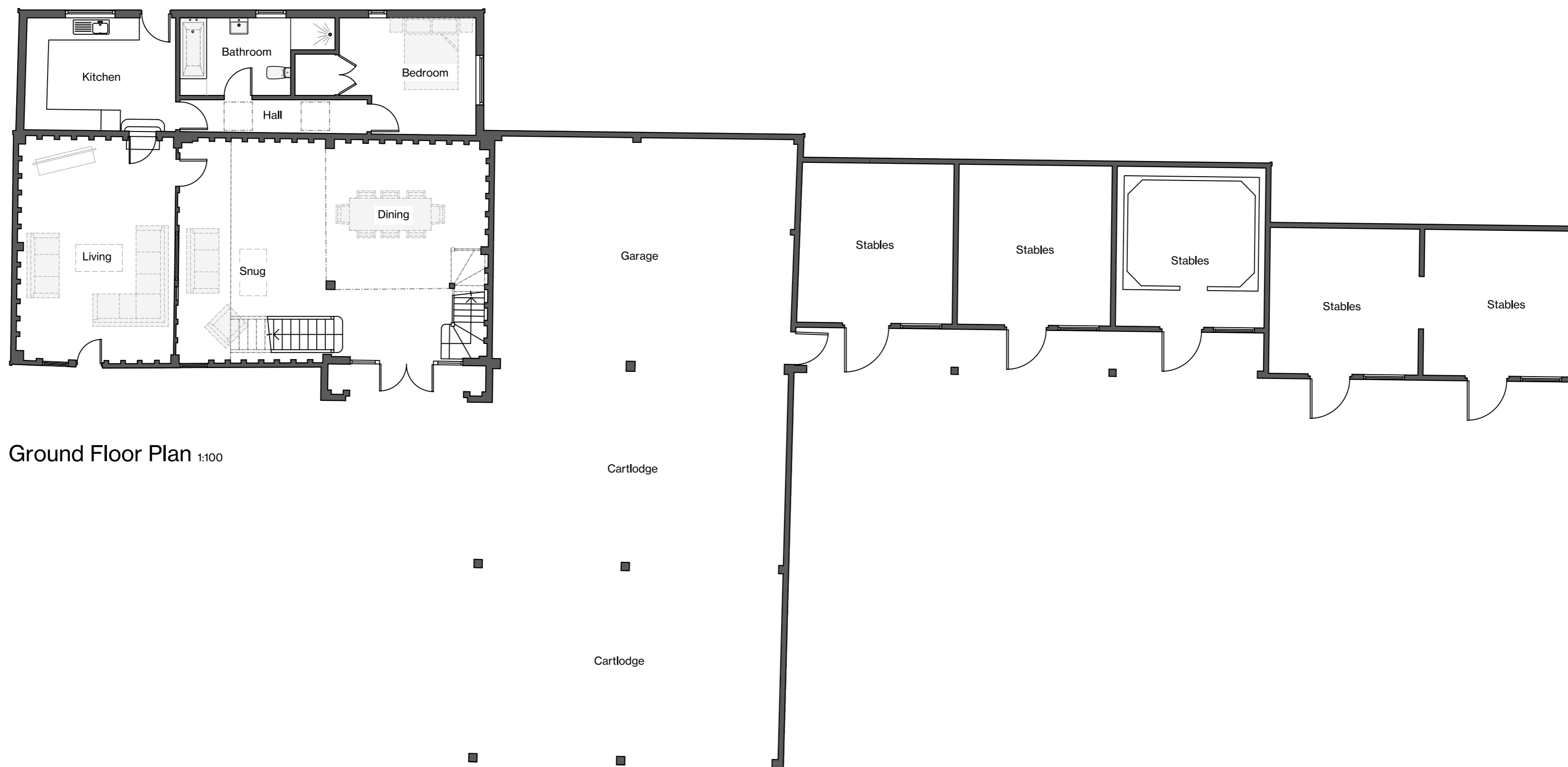
Ground Floor Plan 1:100