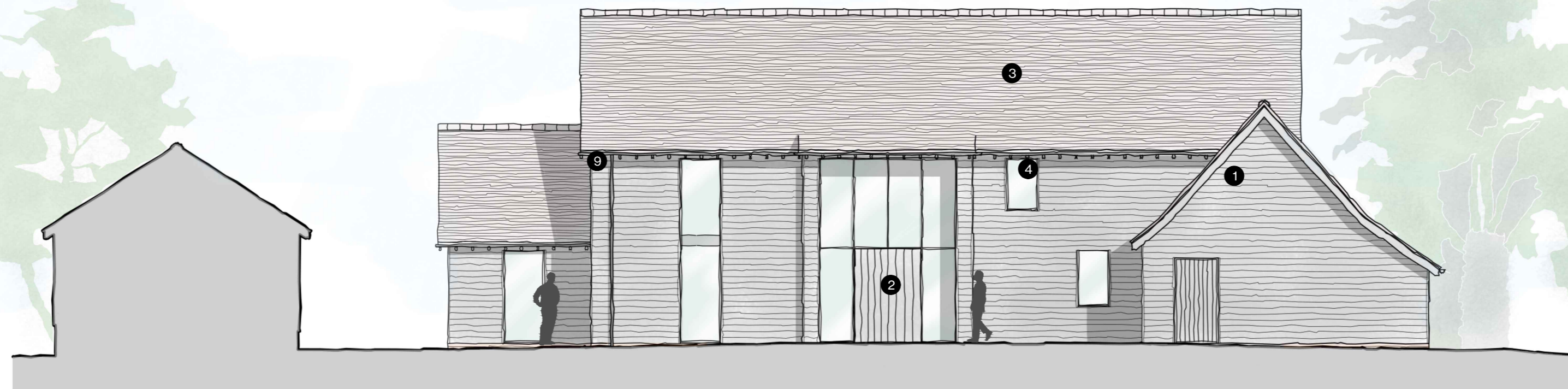
Front w Elevation 1:100