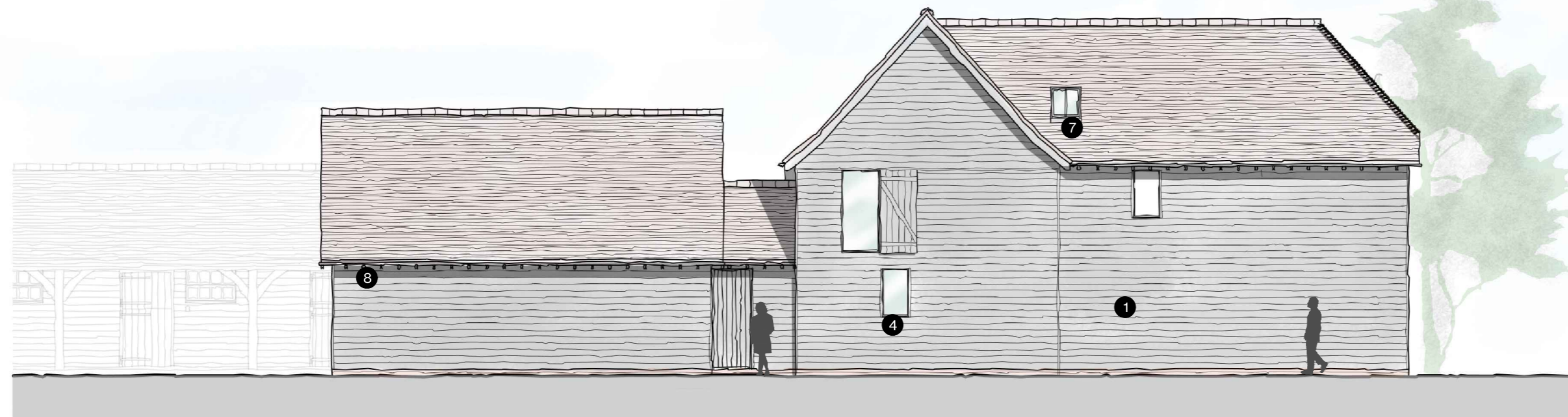
Side S Elevation 1:100