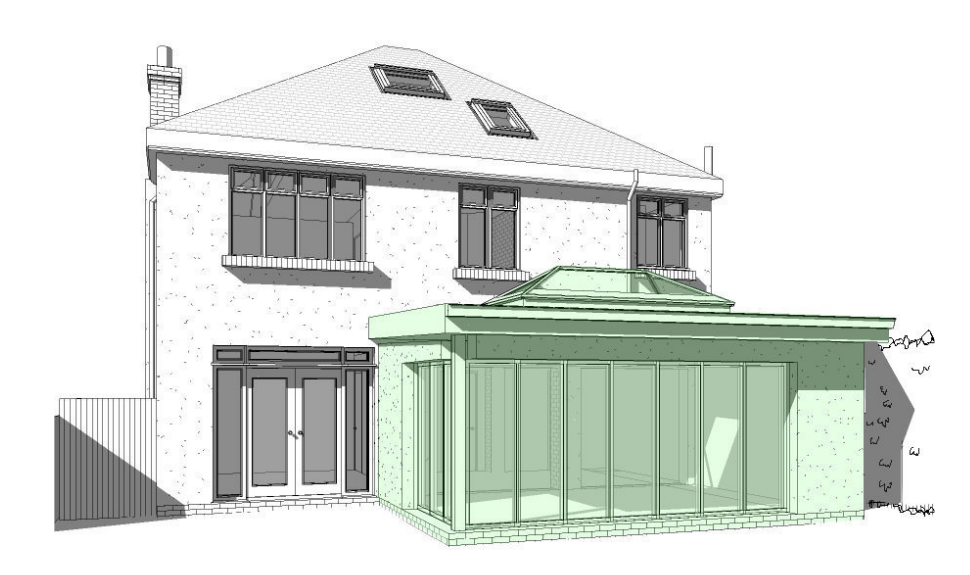
Orangery kitchen/diner extension