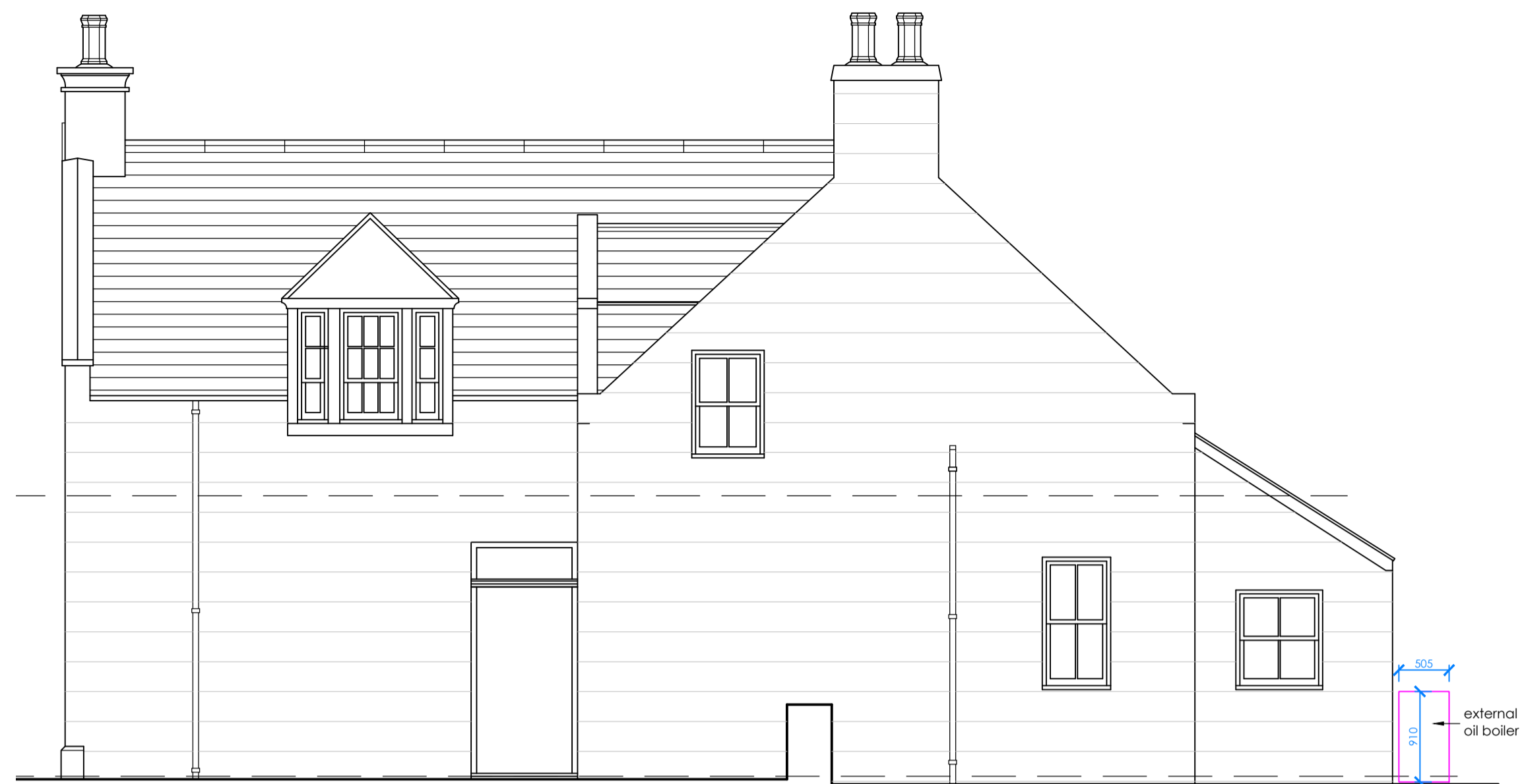
North Elevation Scale: 1:50