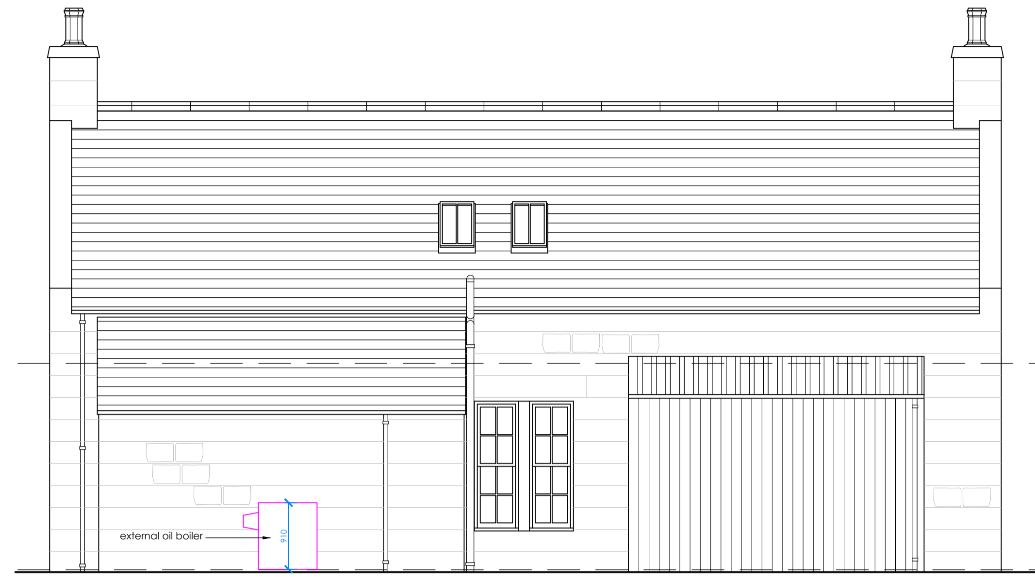
West Elevation Scale: 1:50