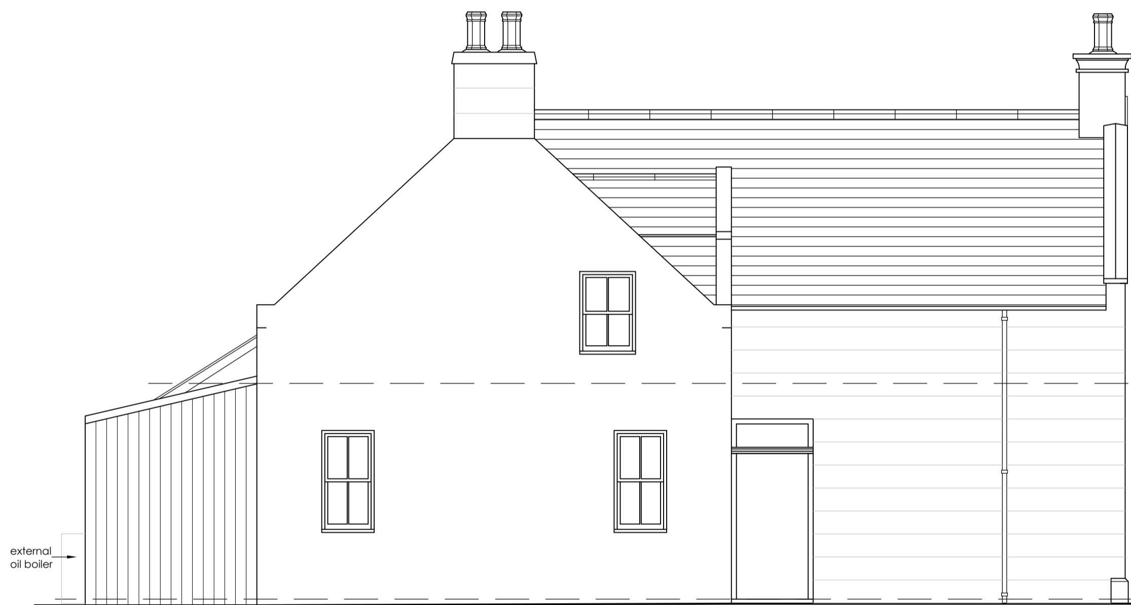
South Elevation Scale: 1:50