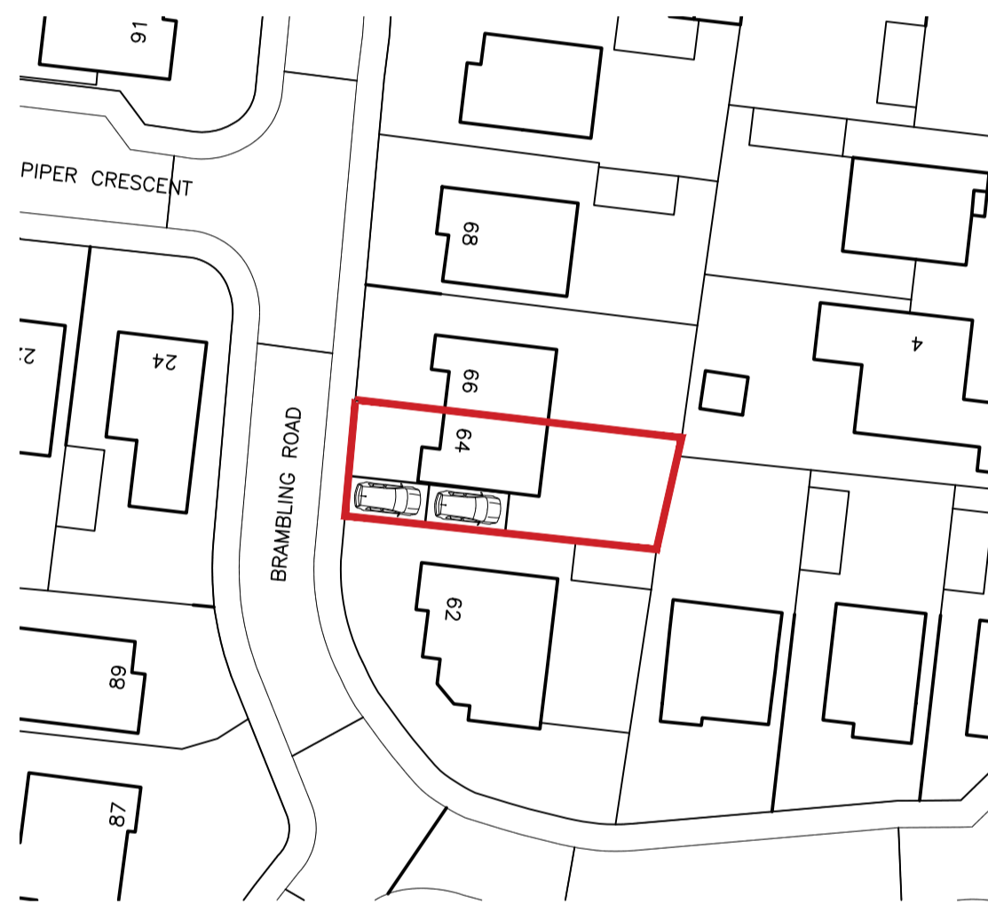
BLOCK PLAN (as proposed) 1:500 @ A1

Use - House, other than a flat, occupied by a single person, or a number living together as a family, or as a household of 5 persons or less. Limited use as a bed & breakfast or guesthouse.