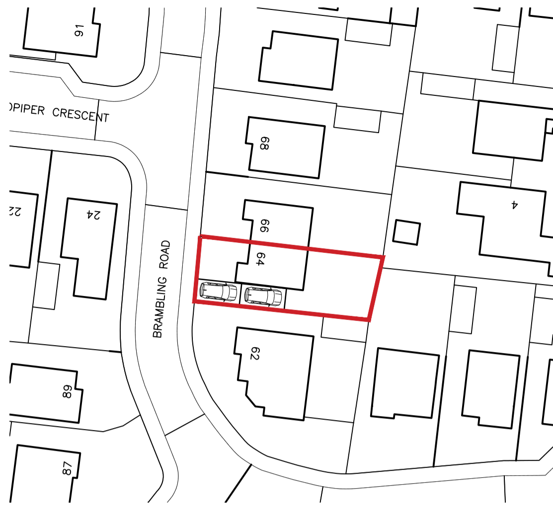
BLOCK PLAN (as existing) 1:500 @ A1

These Drawings are to be read strictly in accordance with any and all other appropriate drawing and specifications associated with the project.