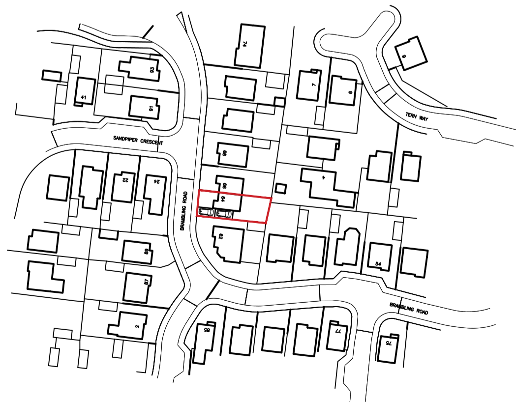
LOCATION PLAN (as existing & proposed) 1:1250 @ A1

Use - Use as serviced accommodation, a hotel, boarding and guest house or hostel where no significant element of care is provided.