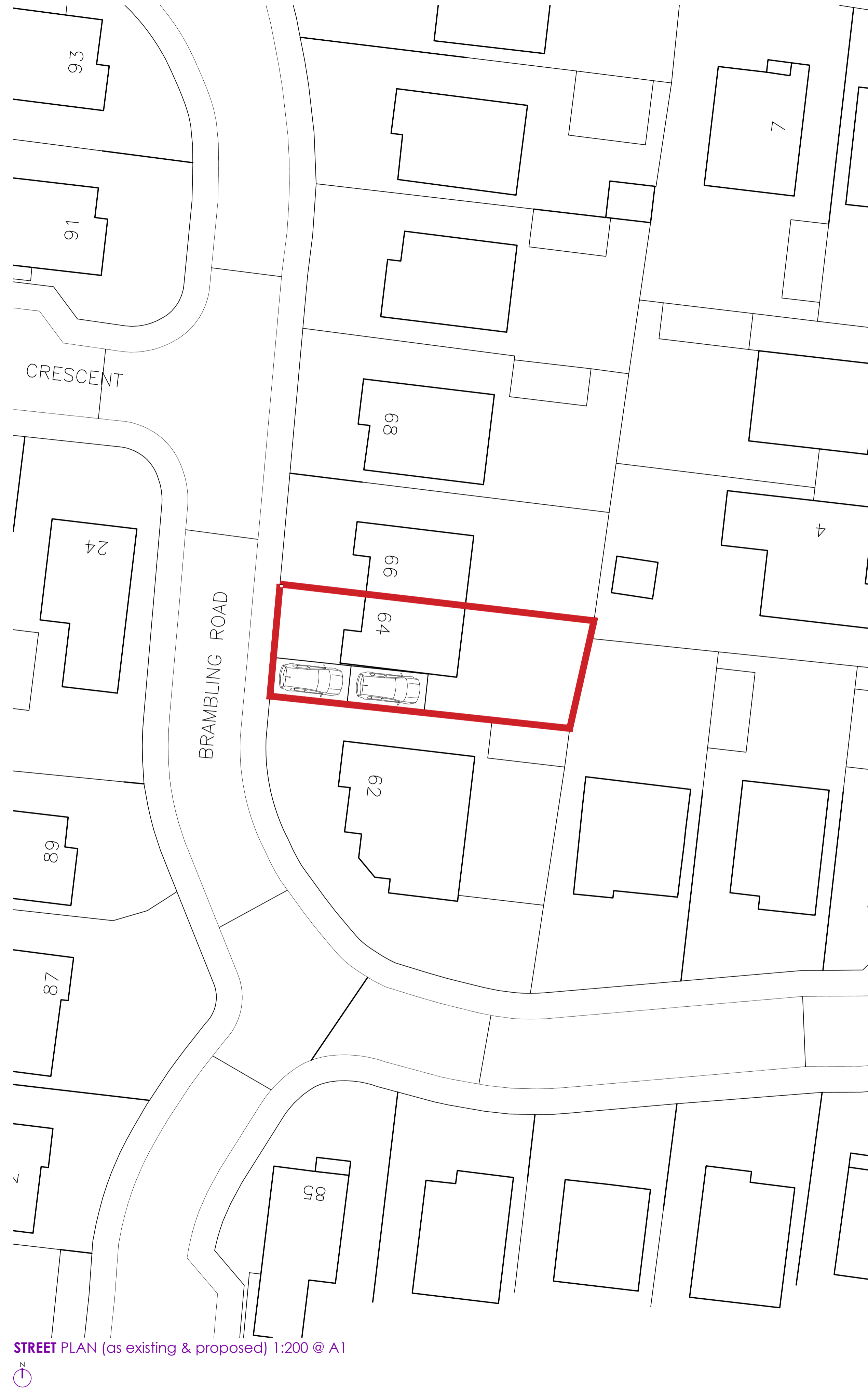
STREET PLAN (as existing & proposed) 1:200 @ A1