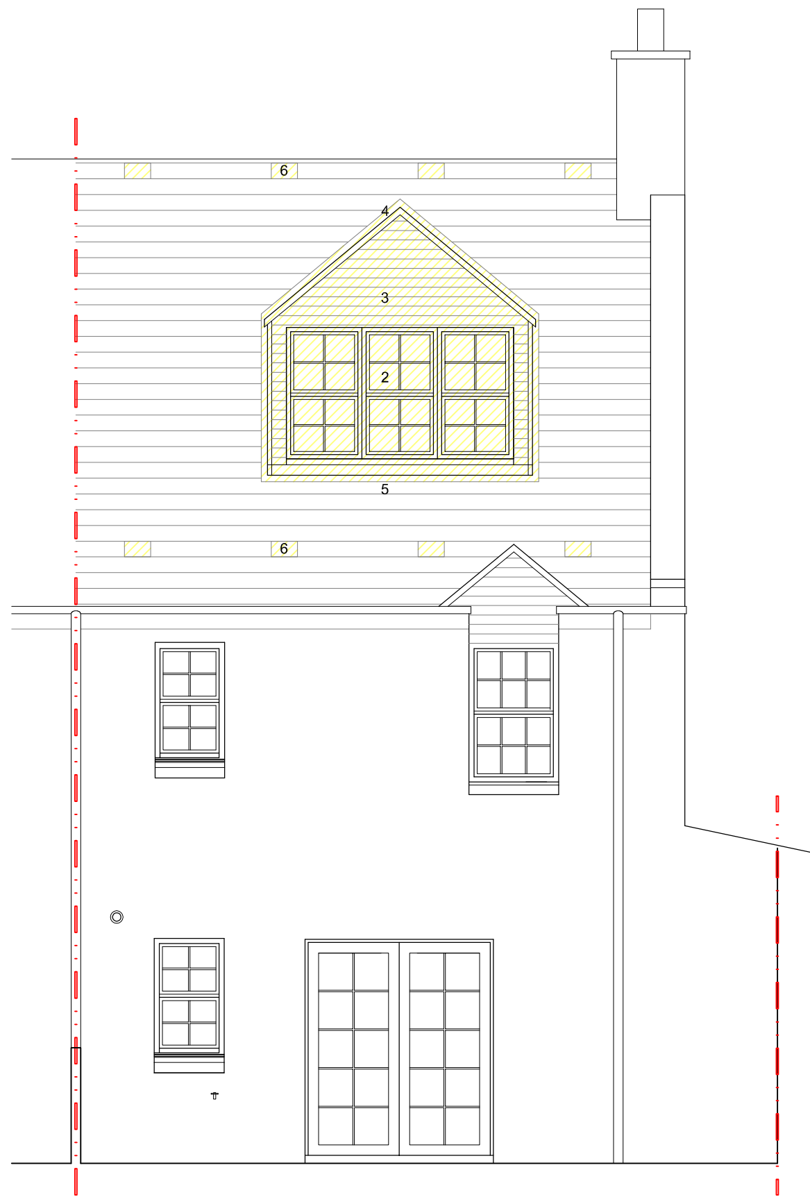
Proposed Rear Elevation (E) 1:50

Do not scale from drawings. All dimensions to be checked on site before proceeding with works. Boundary lines are indicative. TOLA shall be notified in writing of any discrepancies.