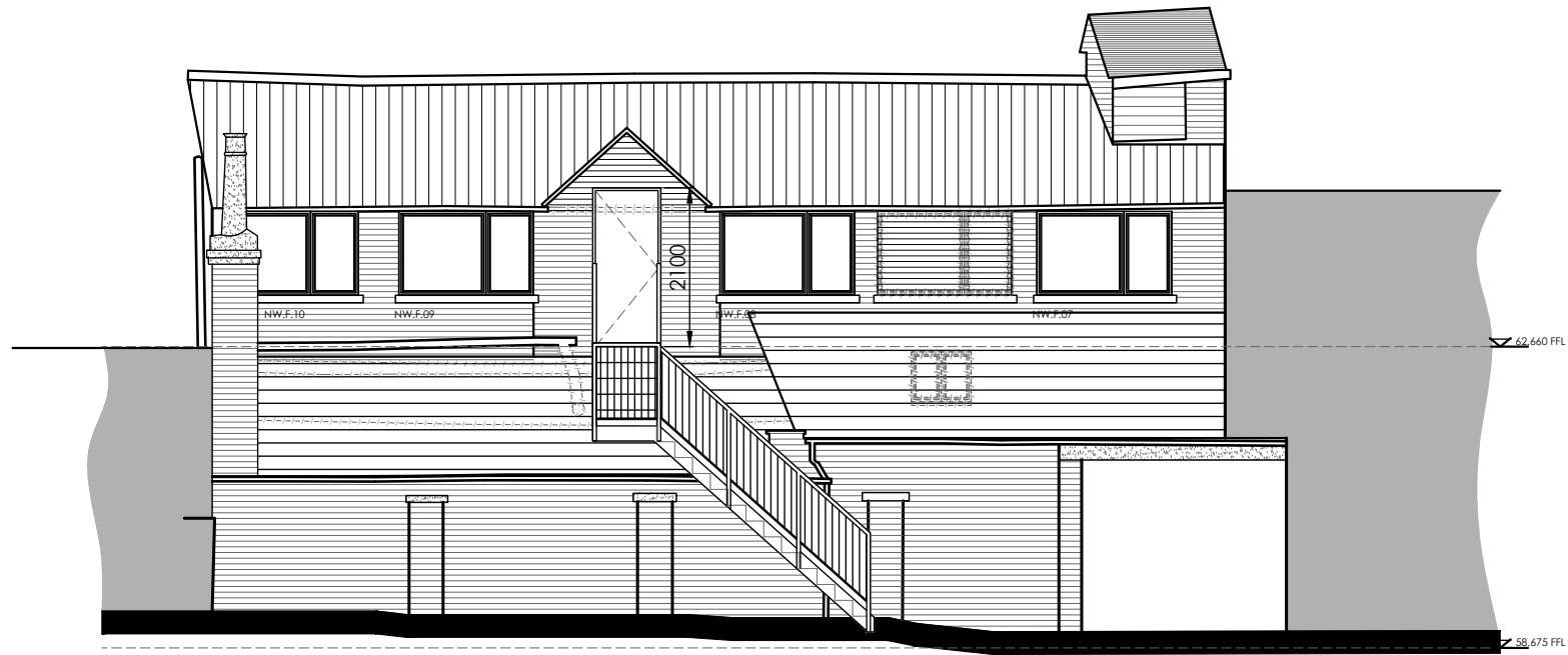
Side Elevation (S)