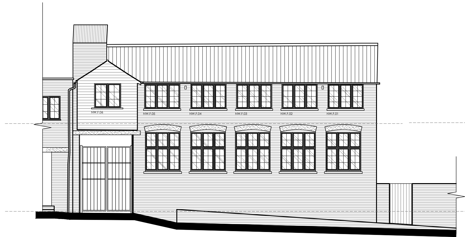
Front Elevation (N)