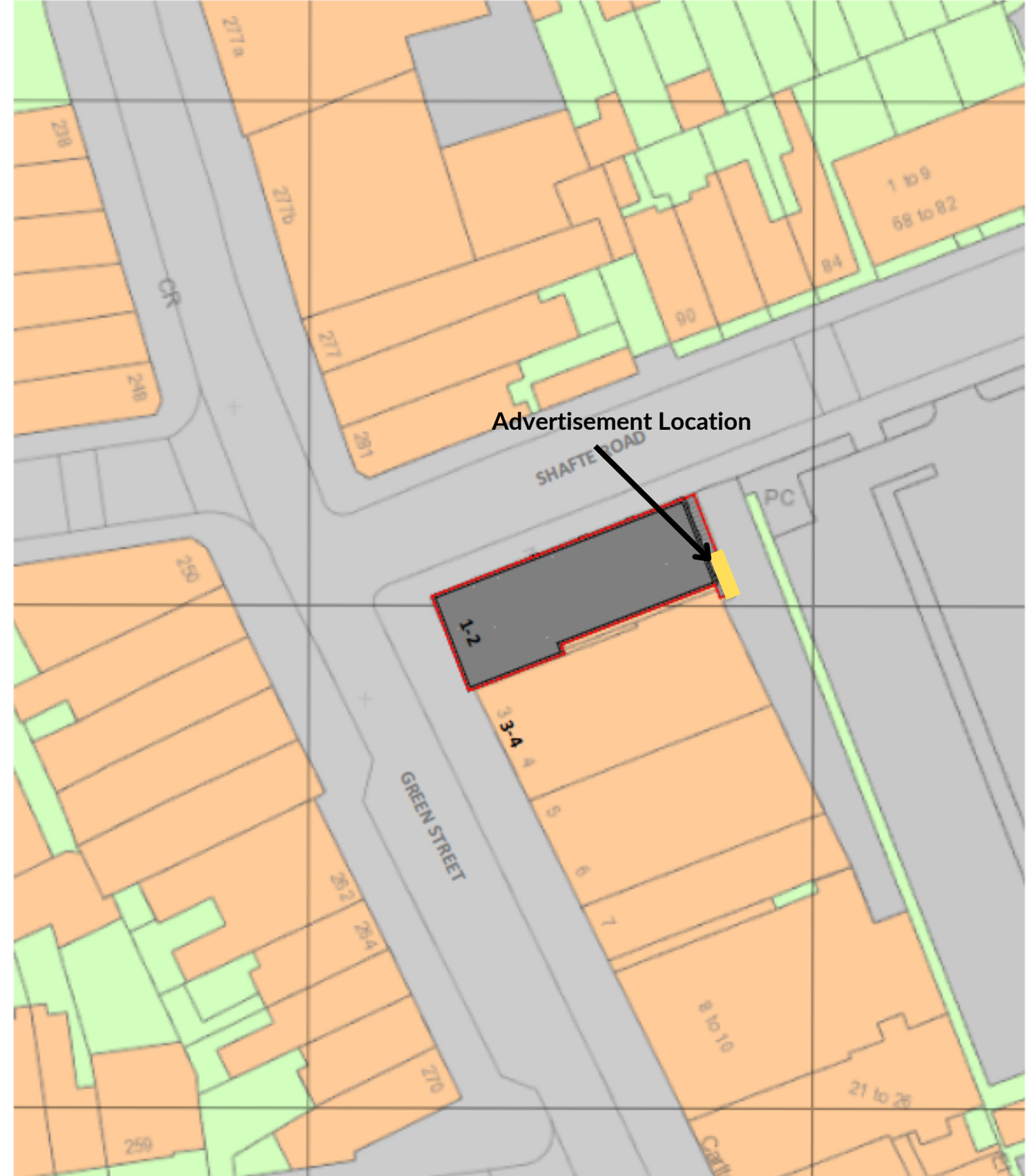
BLOCK PLAN scale 1:500

COPYRIGHT: The contents of this drawing may not be reproduced in whole or in part without express written consent of ARKSS Design Studio Limited.