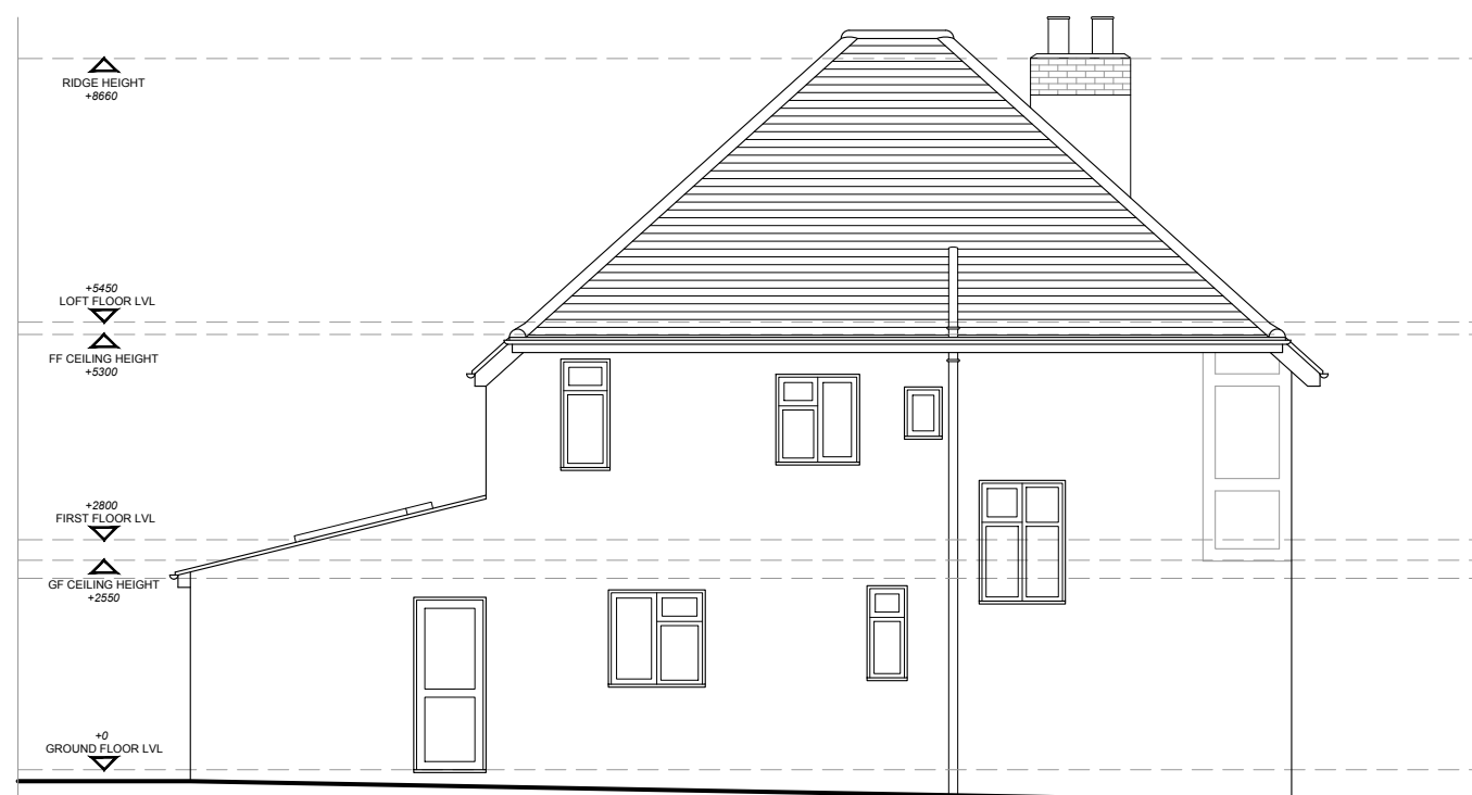
EXST. SIDE ELEVATION 02