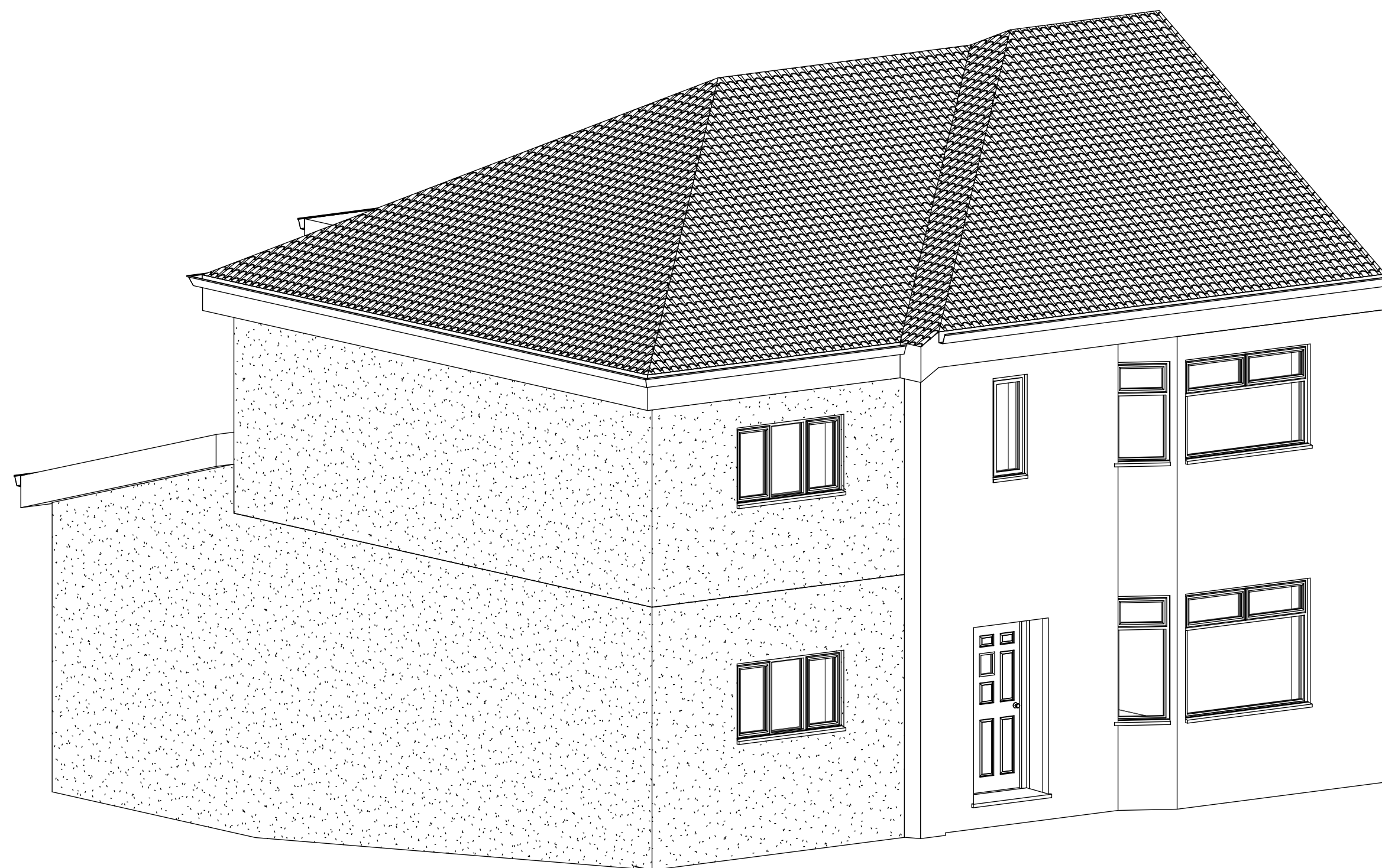
Front 3D Visual

Note: These 3D images are indicative and for visualisation purposes only. Not to scale