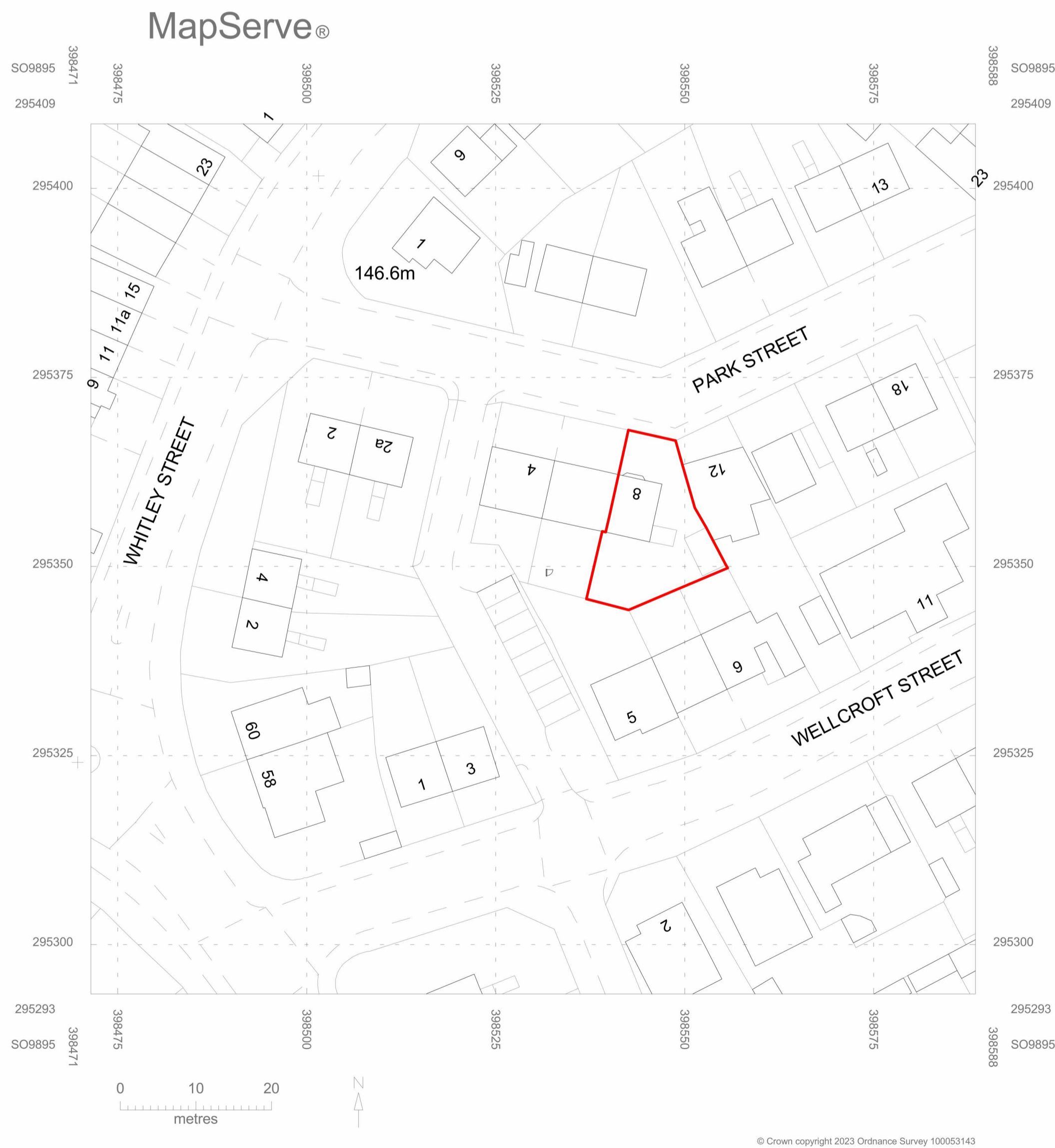
Site Plan 1 : 500