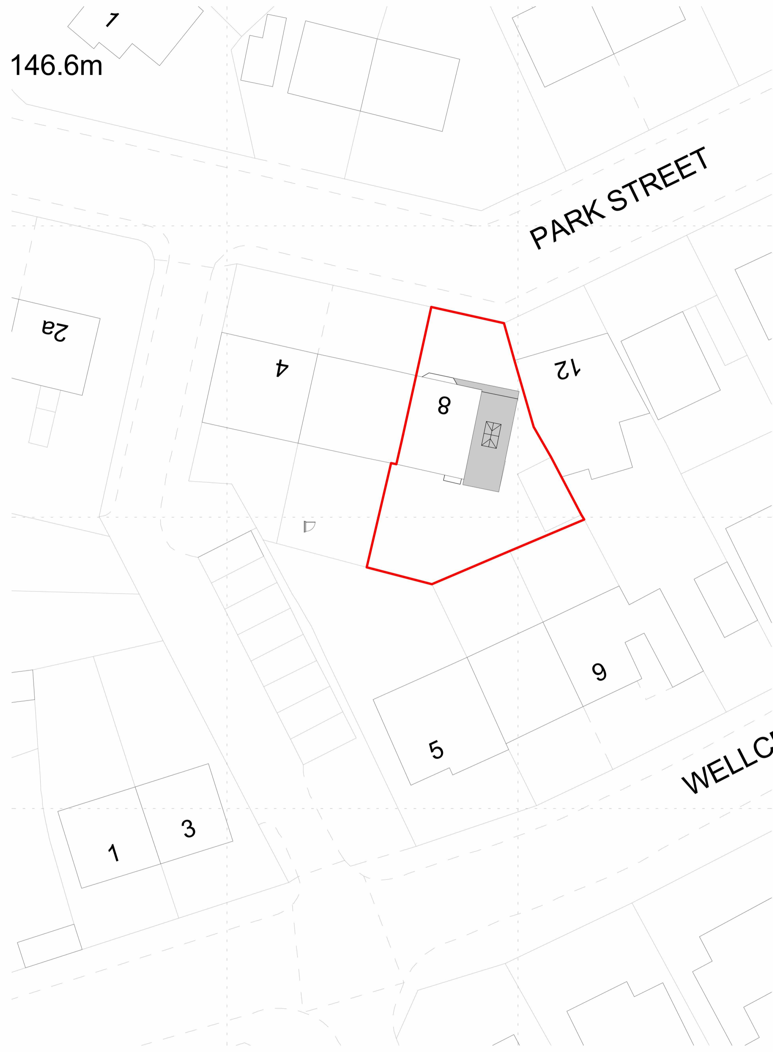
Block Plan 1 : 200