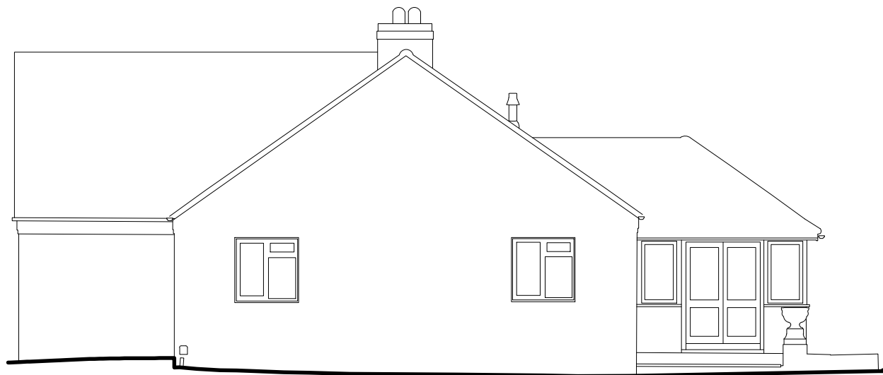
SIDE ELEVATION (NORTH FACING)