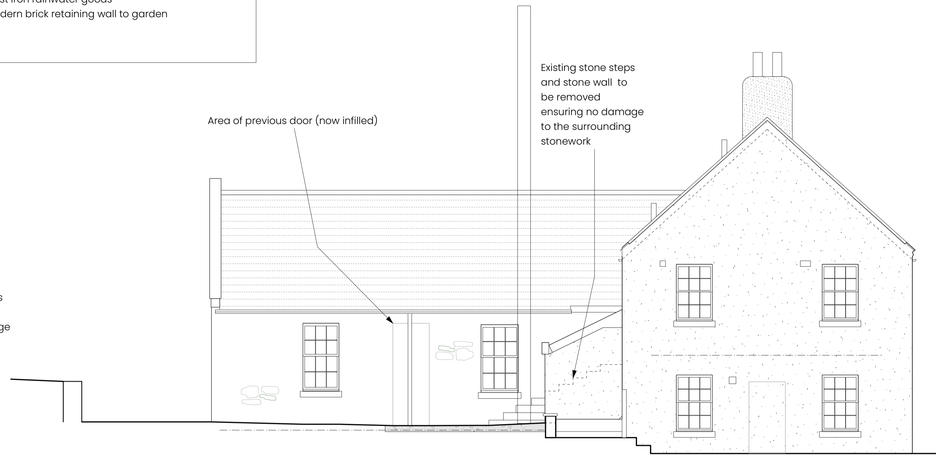
2 EXISTING WEST ELEVATION Scale: 1:50

EXISTING MATERIALS Zinc roof ridge Welsh slates Stone skewes with cement fillets Cement render walls to two storey building Random rubble stonework walls to one storey wing Timber sash & case windows throughout Plain timber door (non-original) to first floor flat Cast iron rainwater goods Modern brick retaining wall to garden