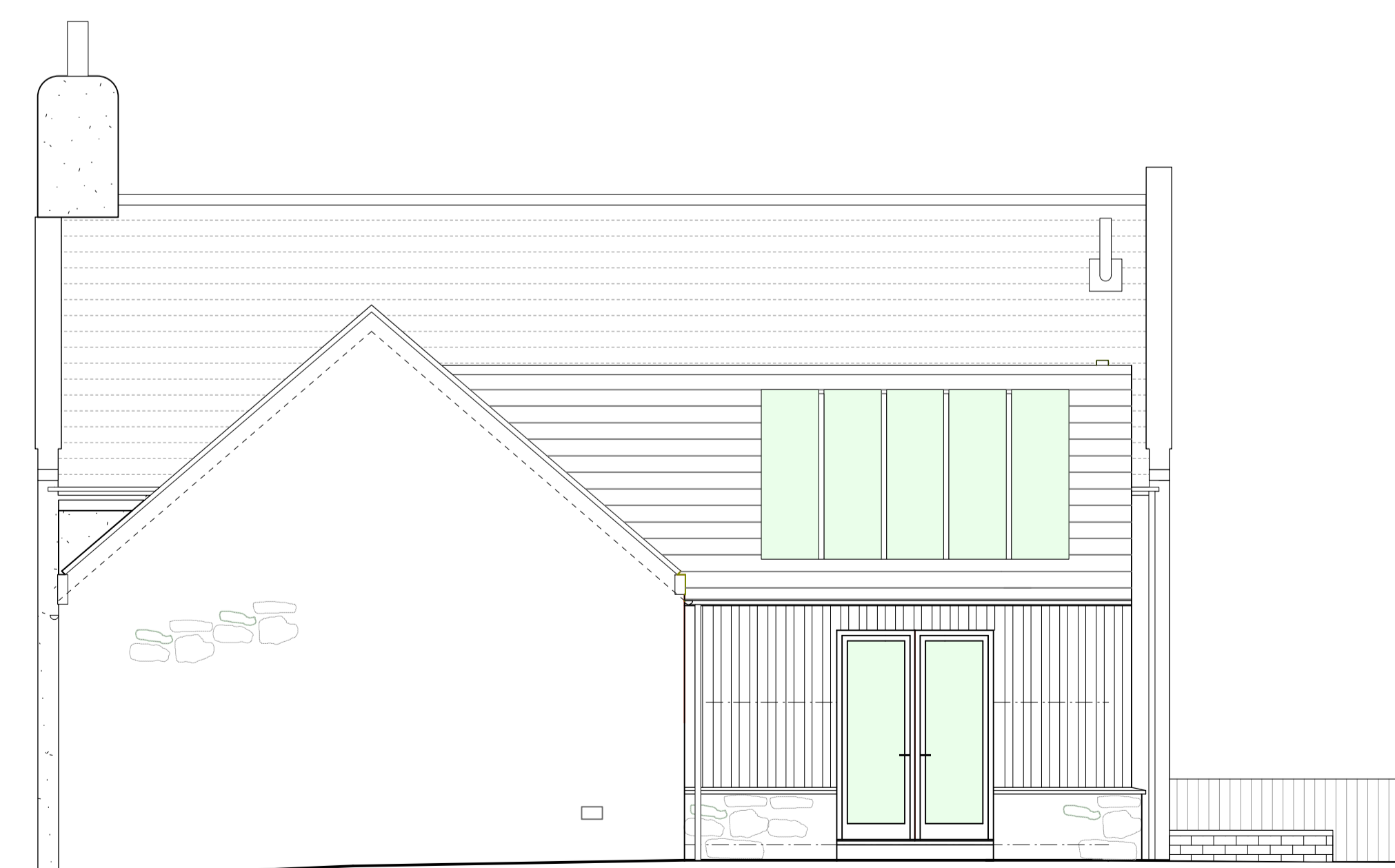
3 PROPOSED NORTH ELEVATION Scale: 1:50

PROPOSED MATERIAL SCHEDULE Zinc ventilated ridge Cupa Heavy Spanish Slate roof with traditional patent glazing system Alumasc aluminium rainwater goods in natural aluminium finish Timber doors & windows with painted finish Russwood Scotlarch board-on-board vertical timber cladding to walls Pre-cast concrete stringcourse around top of stonework - coloured to match stonework Random rubble stone basecourse sourced from farm with lime pointing Pre-cast concrete step to door - coloured to match stonework