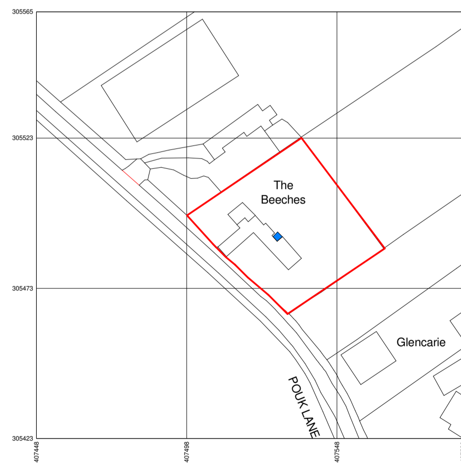
L8 - Location Plan 1 : 1250