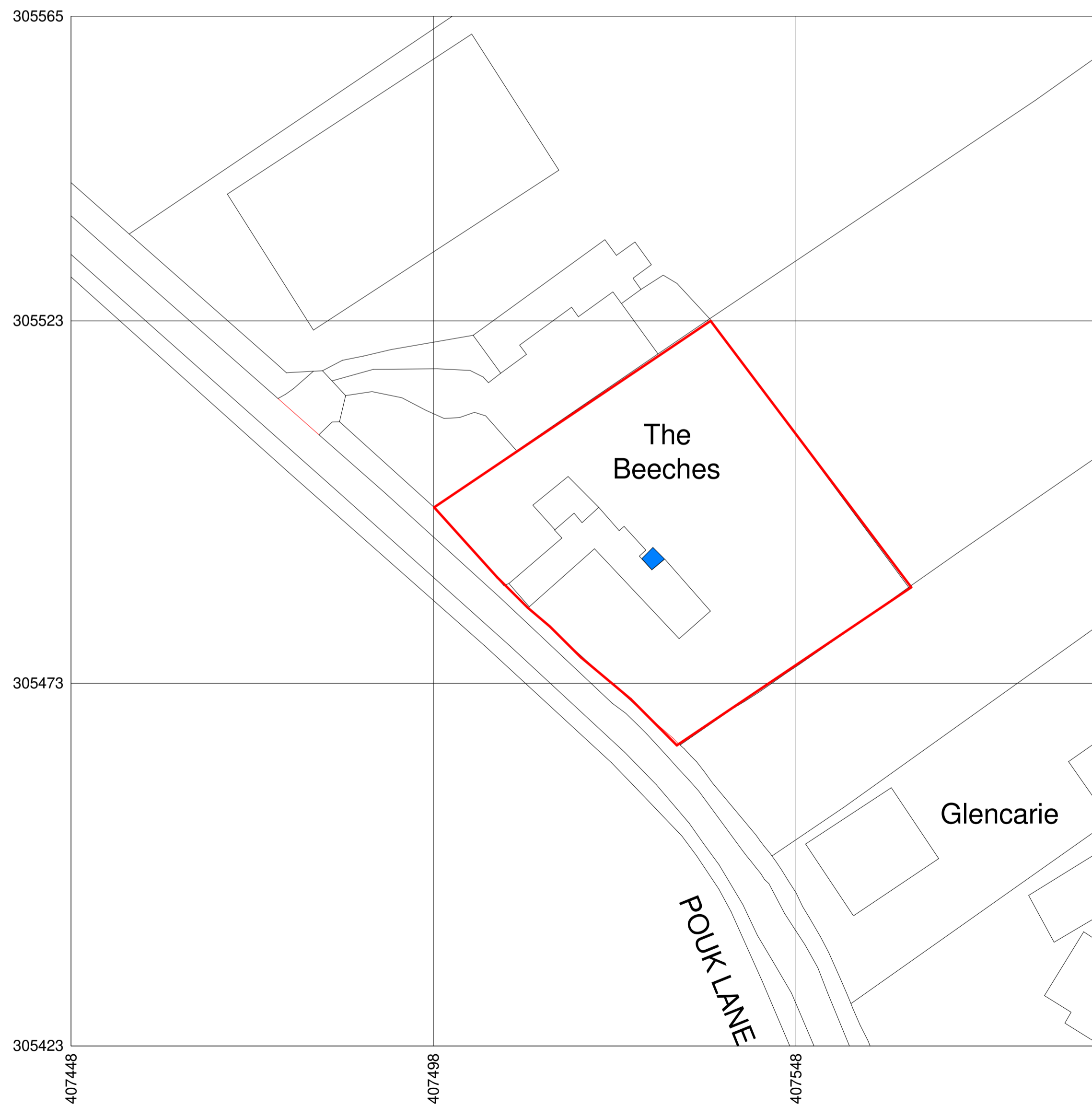
L9 - Block Plan 1 : 500

The drawing is copyright of DSG Architecture Limited and must not be copied or replicated without consent. Drawings should not be scaled for the purpose of measurement. All dimensions are to be verified onsite. Any uncertainty or alterations in the dimensions or design should be confirmed with DSG Architecture Limited prior to the commencement of any work.