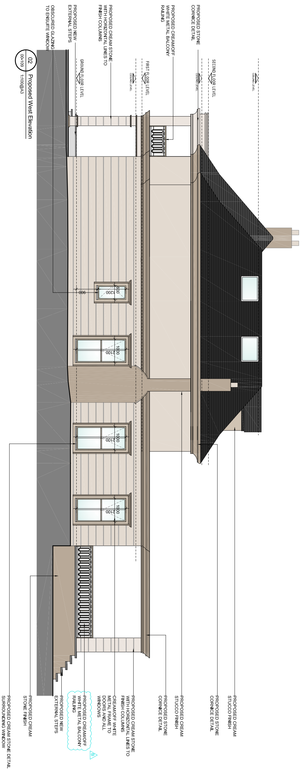
02 Proposed West Elevation 00-109 1:100@A3