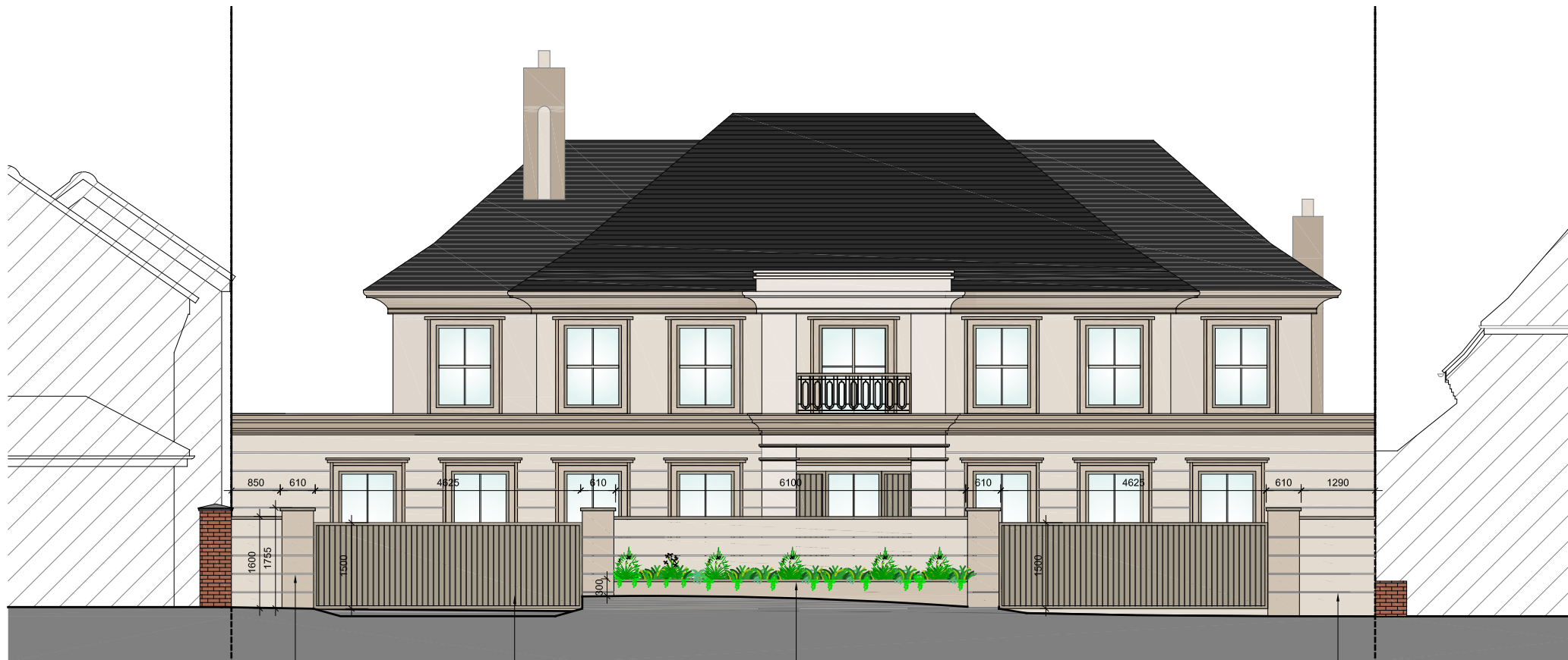
02 Proposed Frontage Elevation 00-111 1:100@A3

PROPOSED CREAM STONE WITH HORIZONTAL LINES TO FINISH