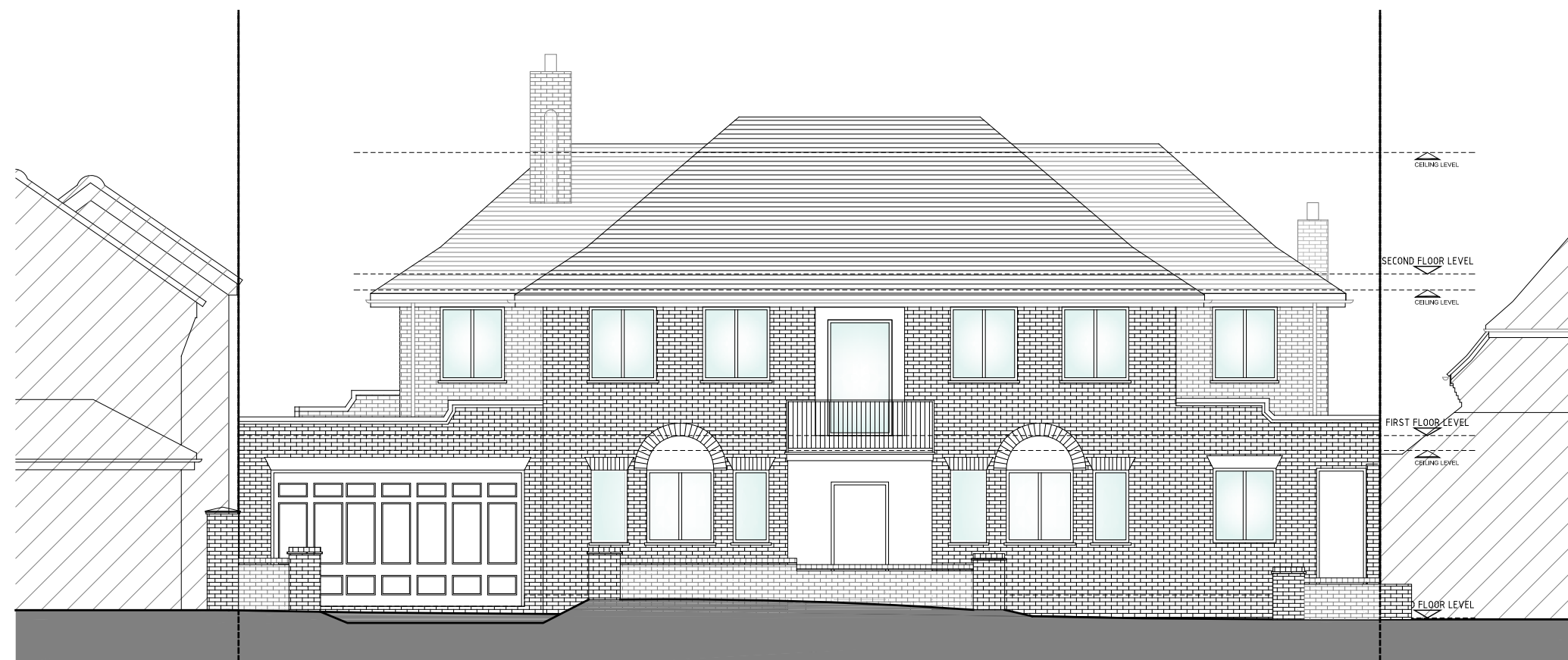
02 Existing Frontage 00-110 1:100@A3