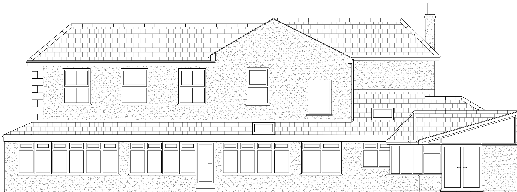
PROPOSED NORTH ELEVATION 1:100

A B C D E F G H I J K L M N O P Q R S T U V W X Y Z