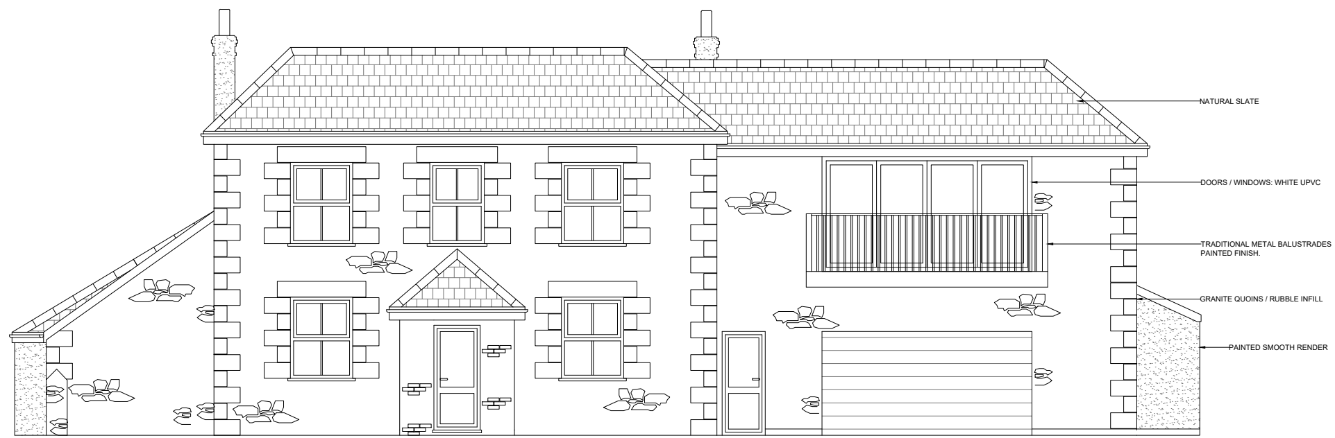
PROPOSED SOUTH ELEVATION 1:100