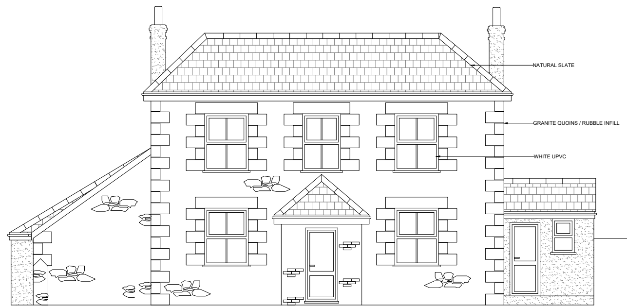
EXISTING SOUTH ELEVATION 1:100