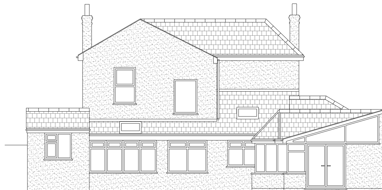
EXISTING NORTH ELEVATION 1:100

A B C D E F G H I J K L M N O P Q R S T U V W X Y Z