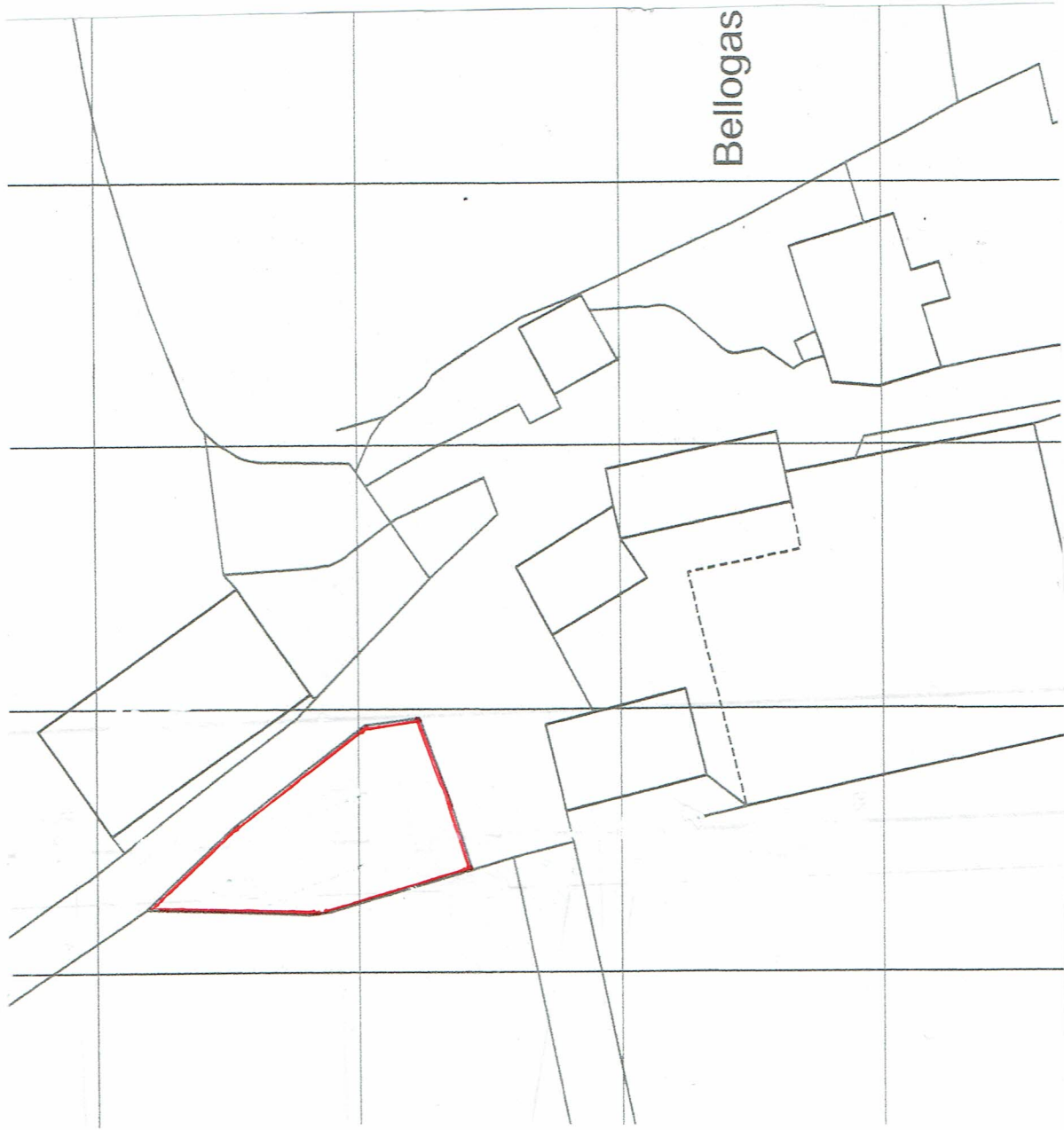
Existing Block Plan.