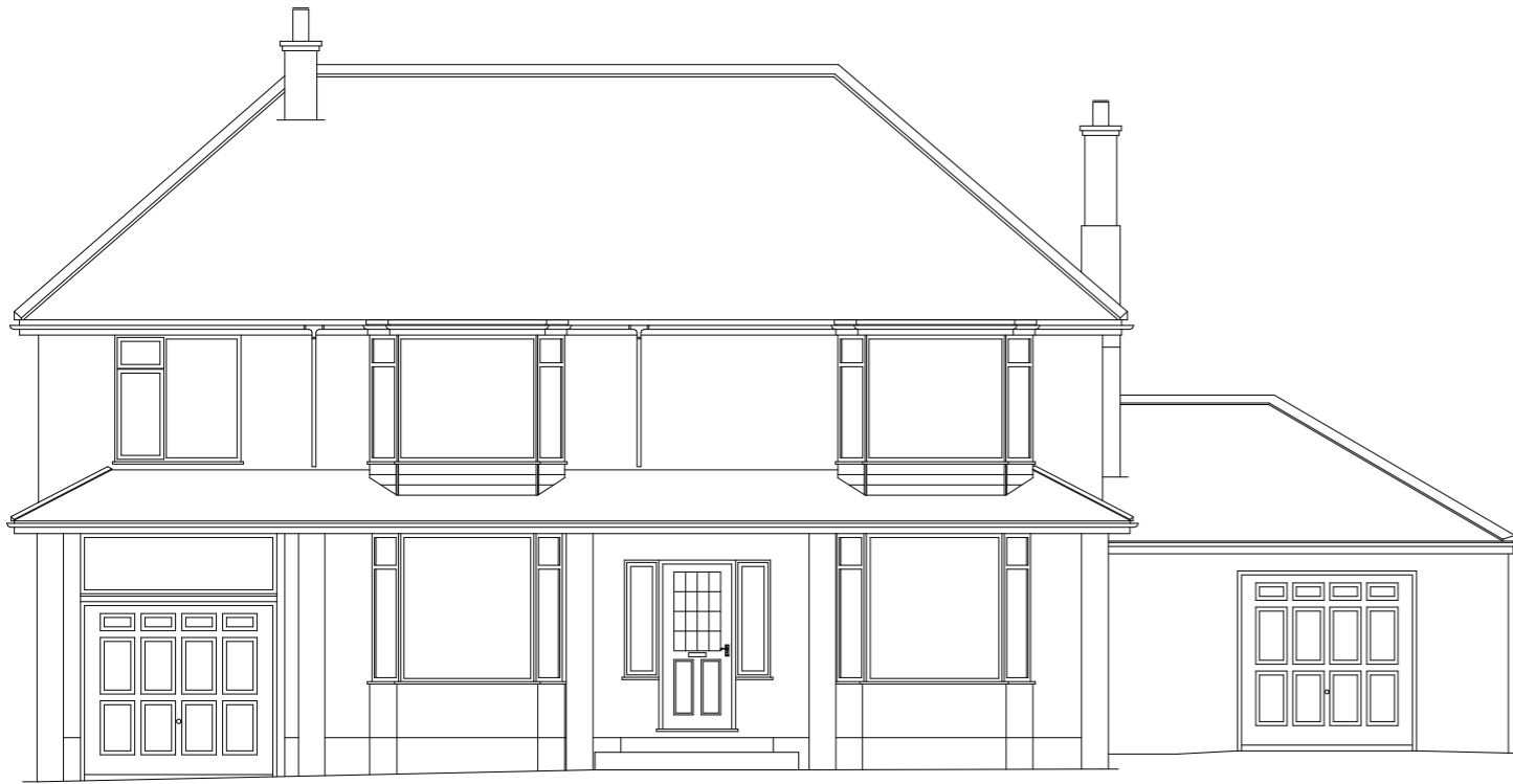
EXISTING SOUTH EAST ELEVATION