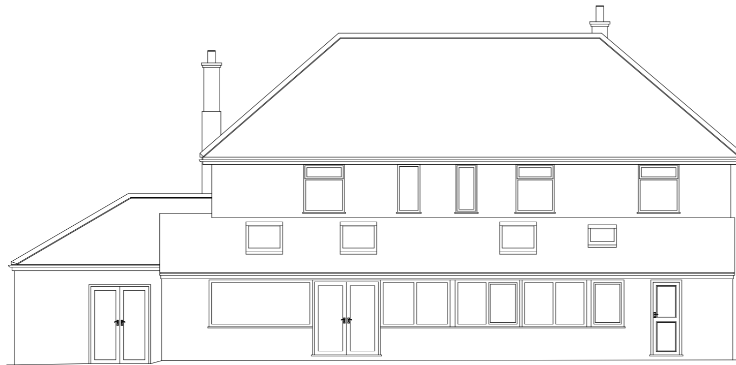
EXISTING NORTH WEST ELEVATION