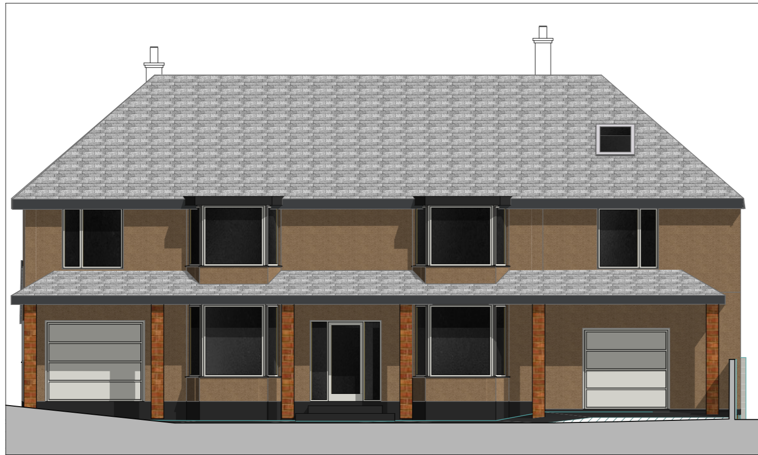
South East Elevation 1:100