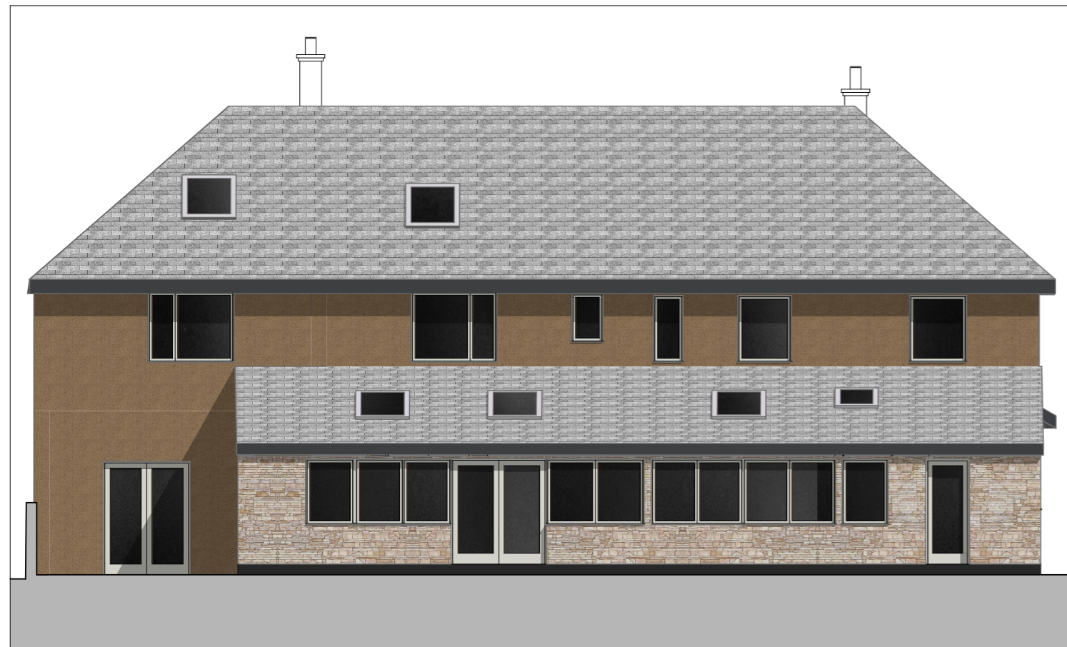
North West Elevation 1:100