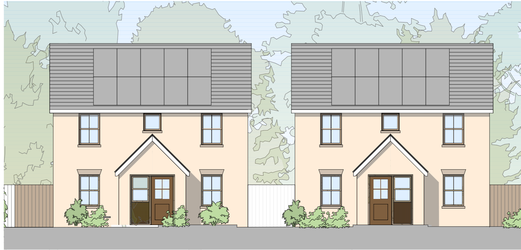
Proposed Front Elevation of Units 1 and 2