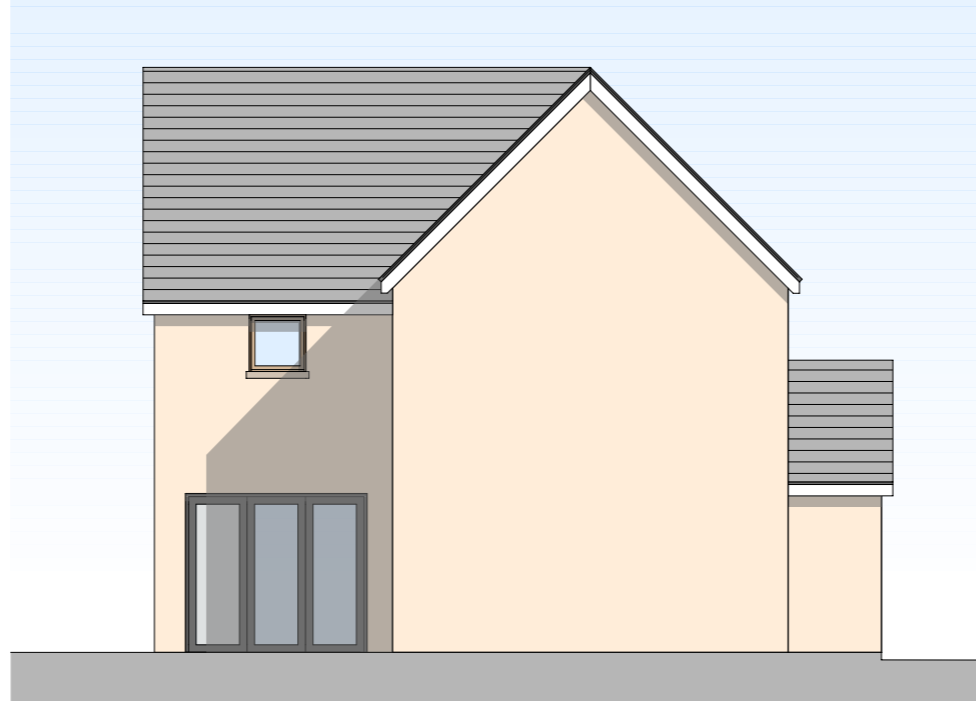
Proposed Side Elevation 1