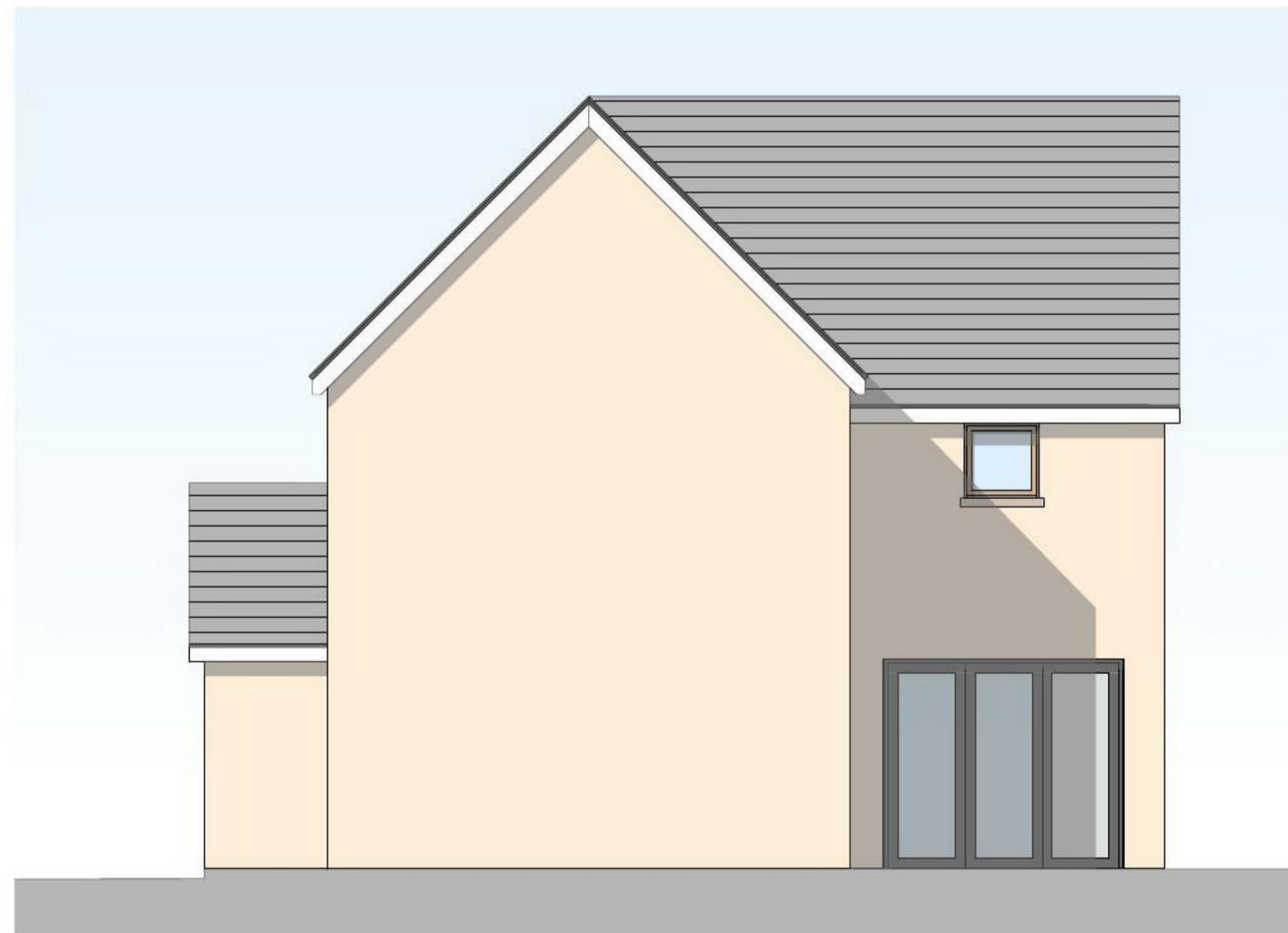
Proposed Side Elevation 1 - Plot 1 (Plot 2 handed)