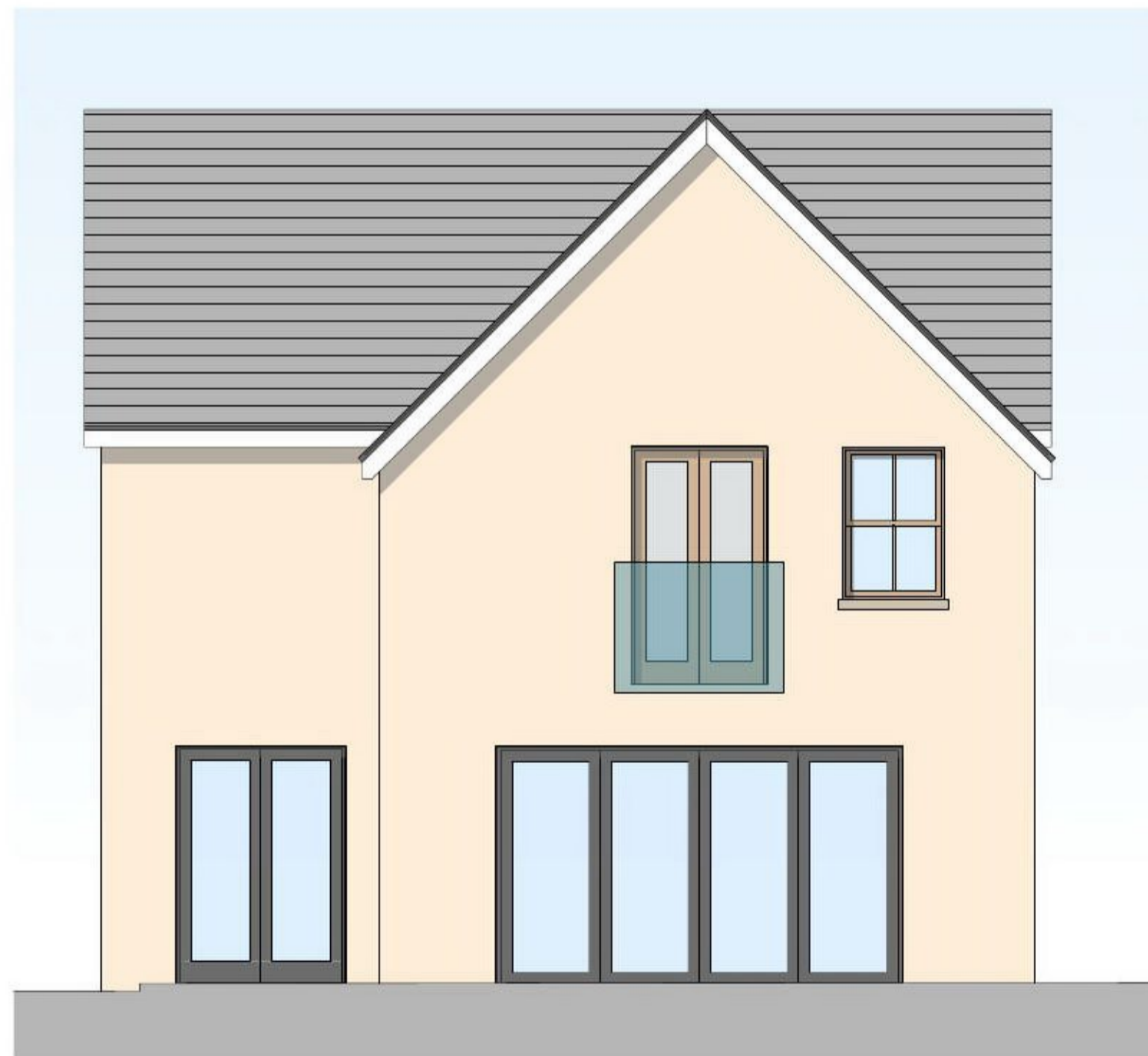
Proposed Rear Elevation - (Plot 2 handed)