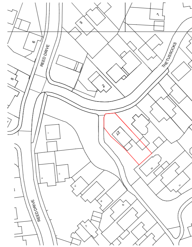
Proposed Location Plan - Scale 1:1250