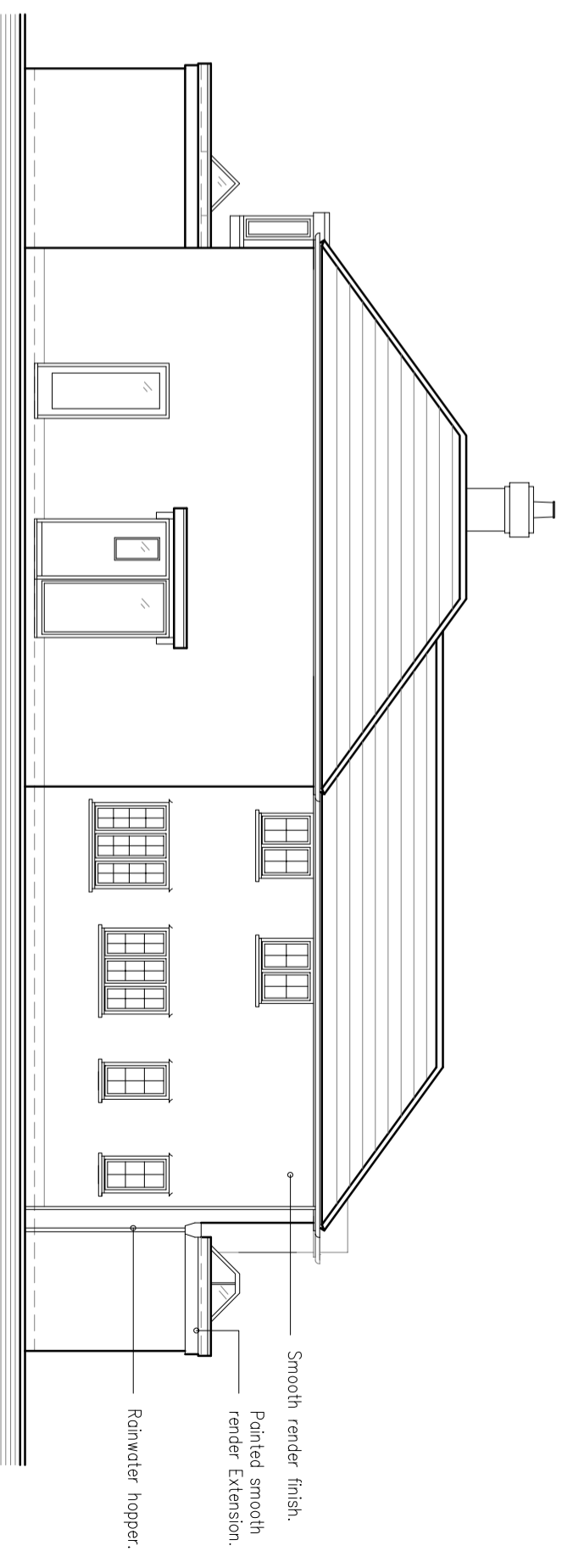
East Facing Elevation